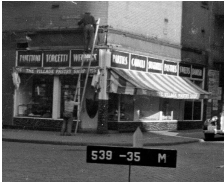
HISTORIC PHOTO - 1940s 155 BLEECKER STREET