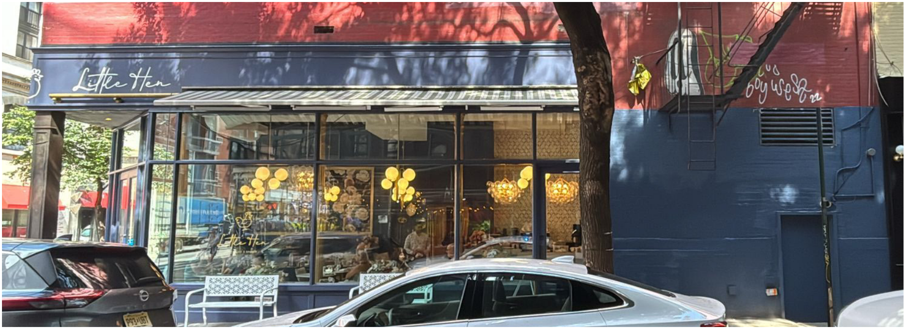
PRE-EXISTING PAINTED BRICK