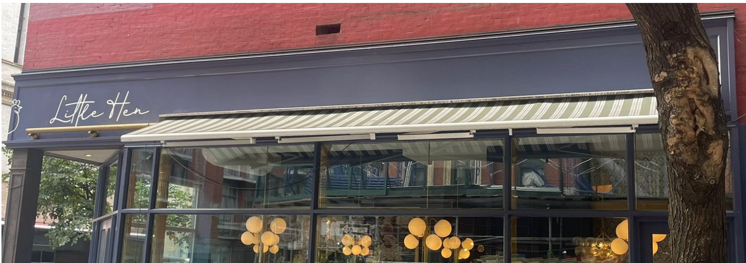
PRE-EXISTING LIGHT FIXTURE