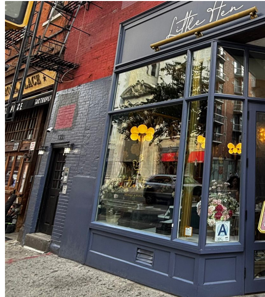
CURRENT CONDITION PHOTO - 2025 BLEECKER STREET SIDE