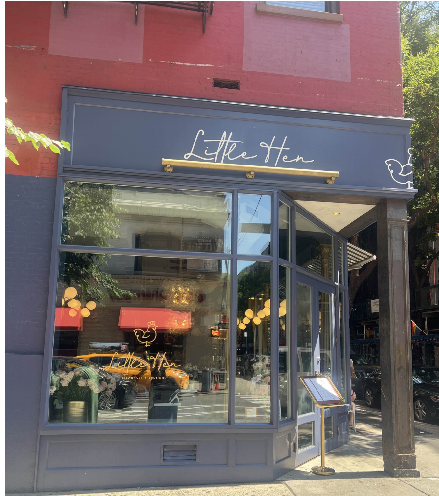
CURRENT CONDITION PHOTO - 2025 BLEECKER STREET SIDE