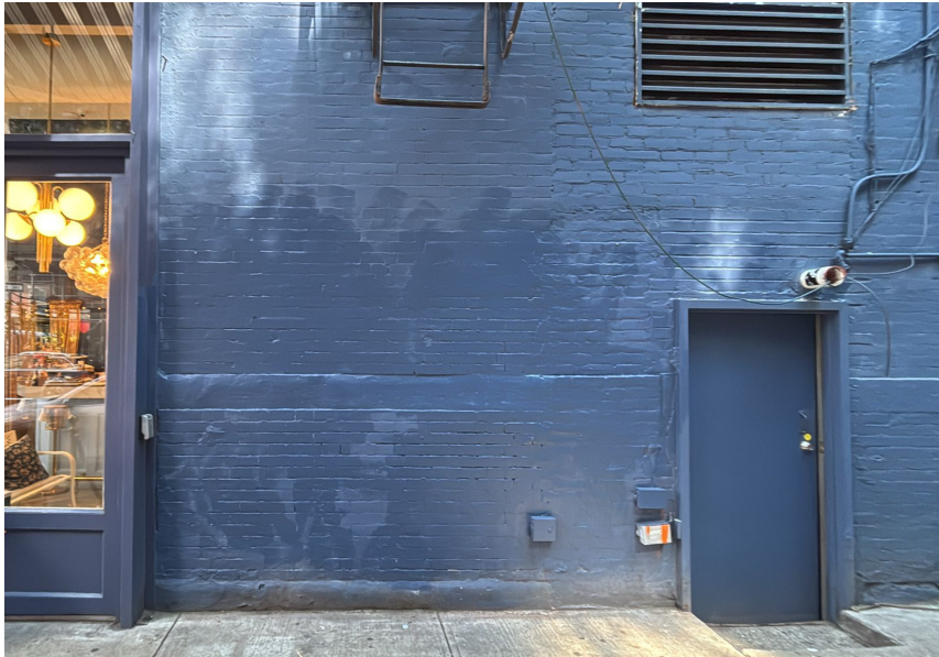
CURRENT CONDITION PHOTO - 2025 THOMPSON STREET SIDE