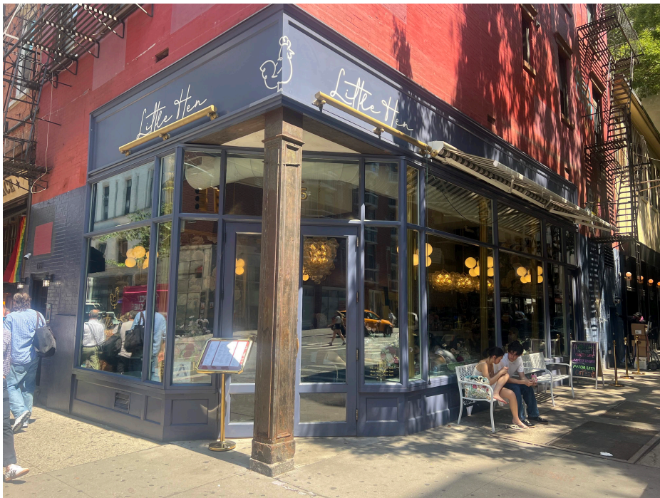
CURRENT CONDITION PHOTO - 2025