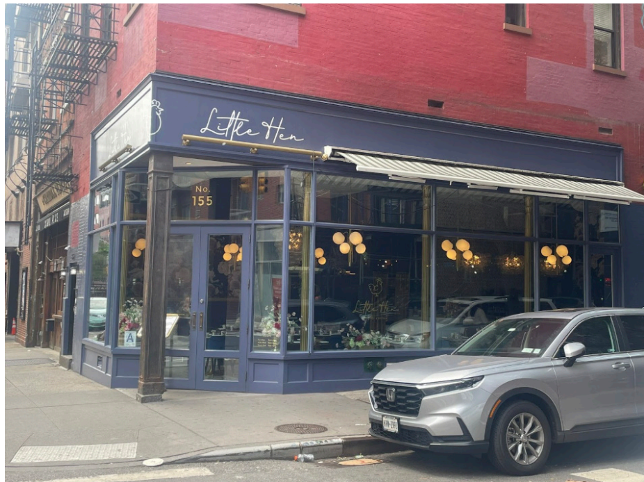
CURRENT CONDITION PHOTO - 2025 THOMPSON STREET SIDE