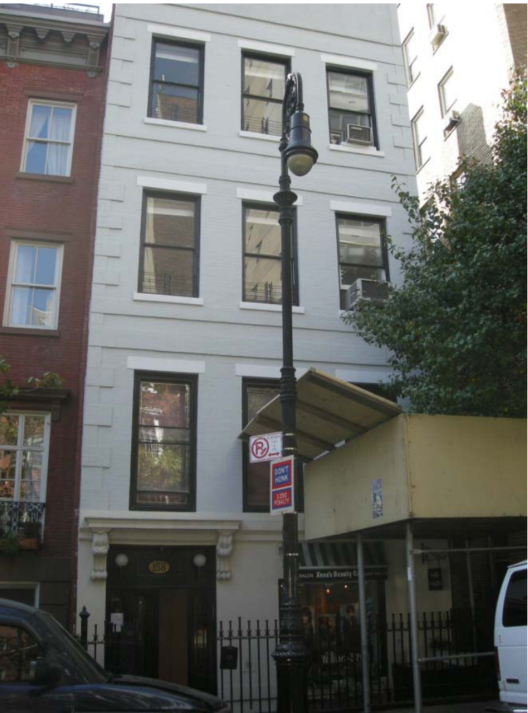
158 W 13 th (1846/1901)

128 West 13 th Street Coated Stone on West 13 th Block Mary B Dierickx Historic Preservation Consulting