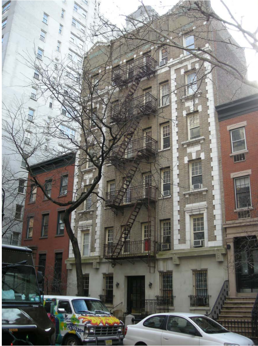
106 W 13 th St (1911)