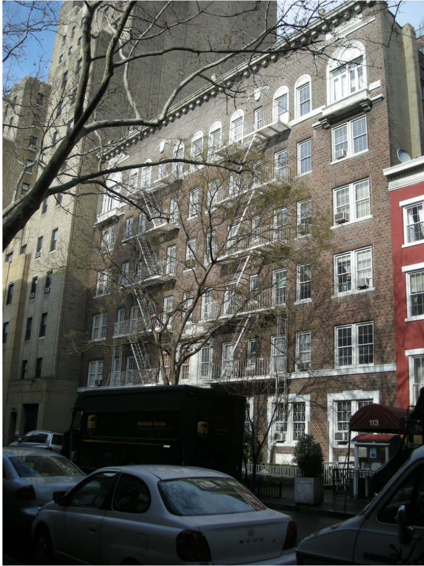
117 W 13 th (1923-4) & 111 W 13 th at far right