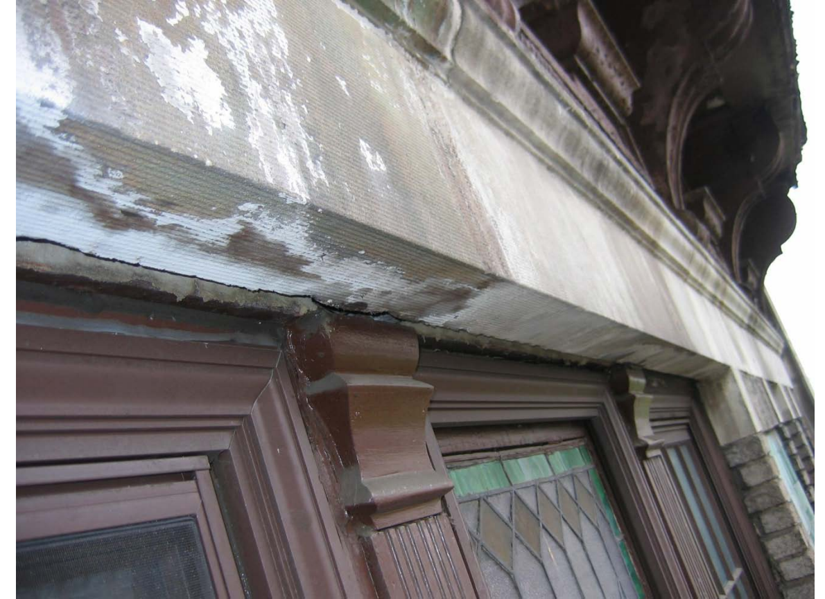
Existing Conditions Before Repair Showing Stained, Water Damaged & Weathered Stone