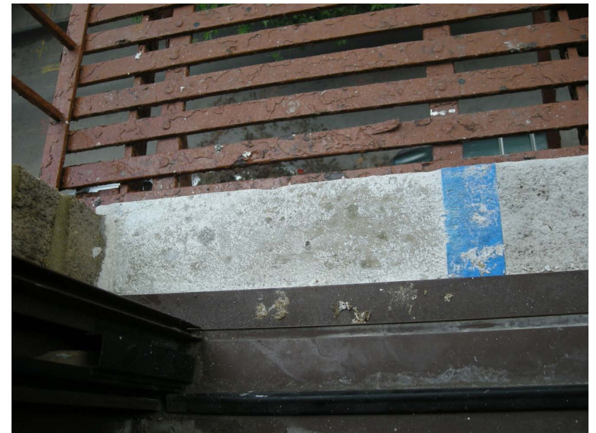
Masonry coating removal test after 2 applications of paint remover rinsed with water spray, no pressure

128 West 13 th Street Conditions 12/20/2011