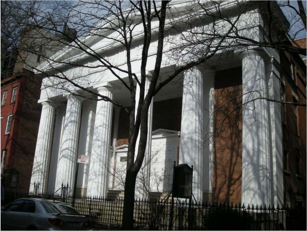
143 W 13 th (1846/1903)