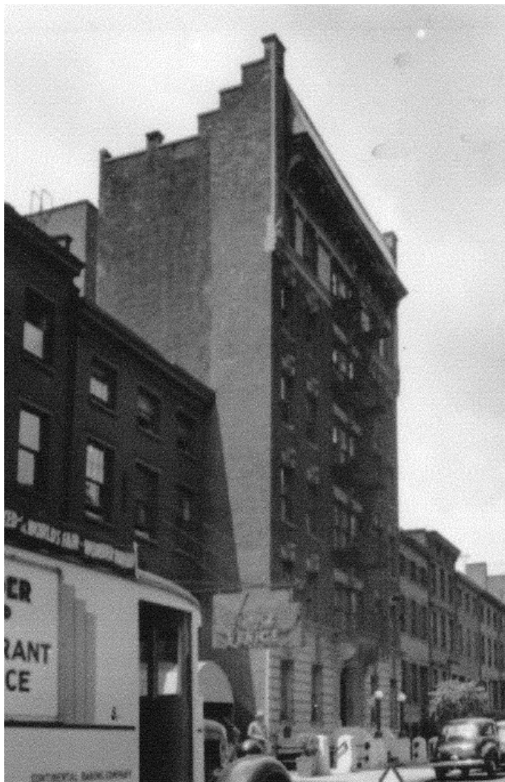
C1940 (Municipal Archives)