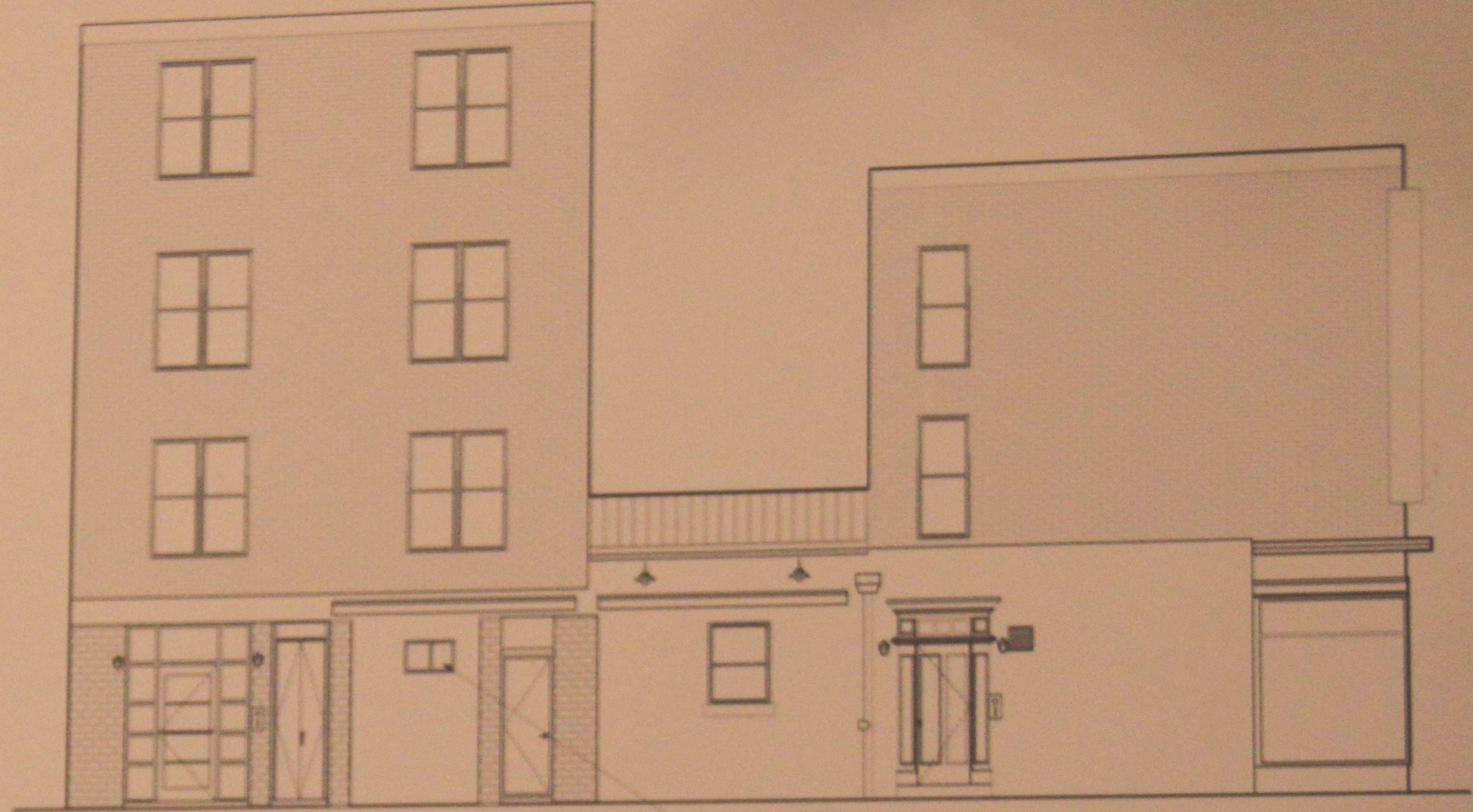
2 328 WEST 4TH ELEVATION - EXISTING CONDITIONS Scale: 1/4" = 1'-0"