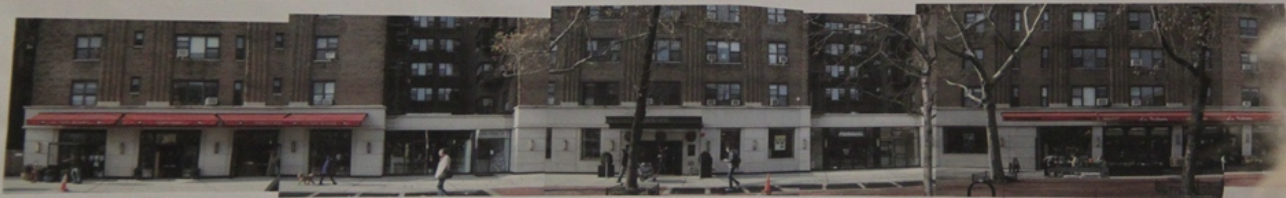
5 SIXTH AVENUE STOREFRONT ELEVATION