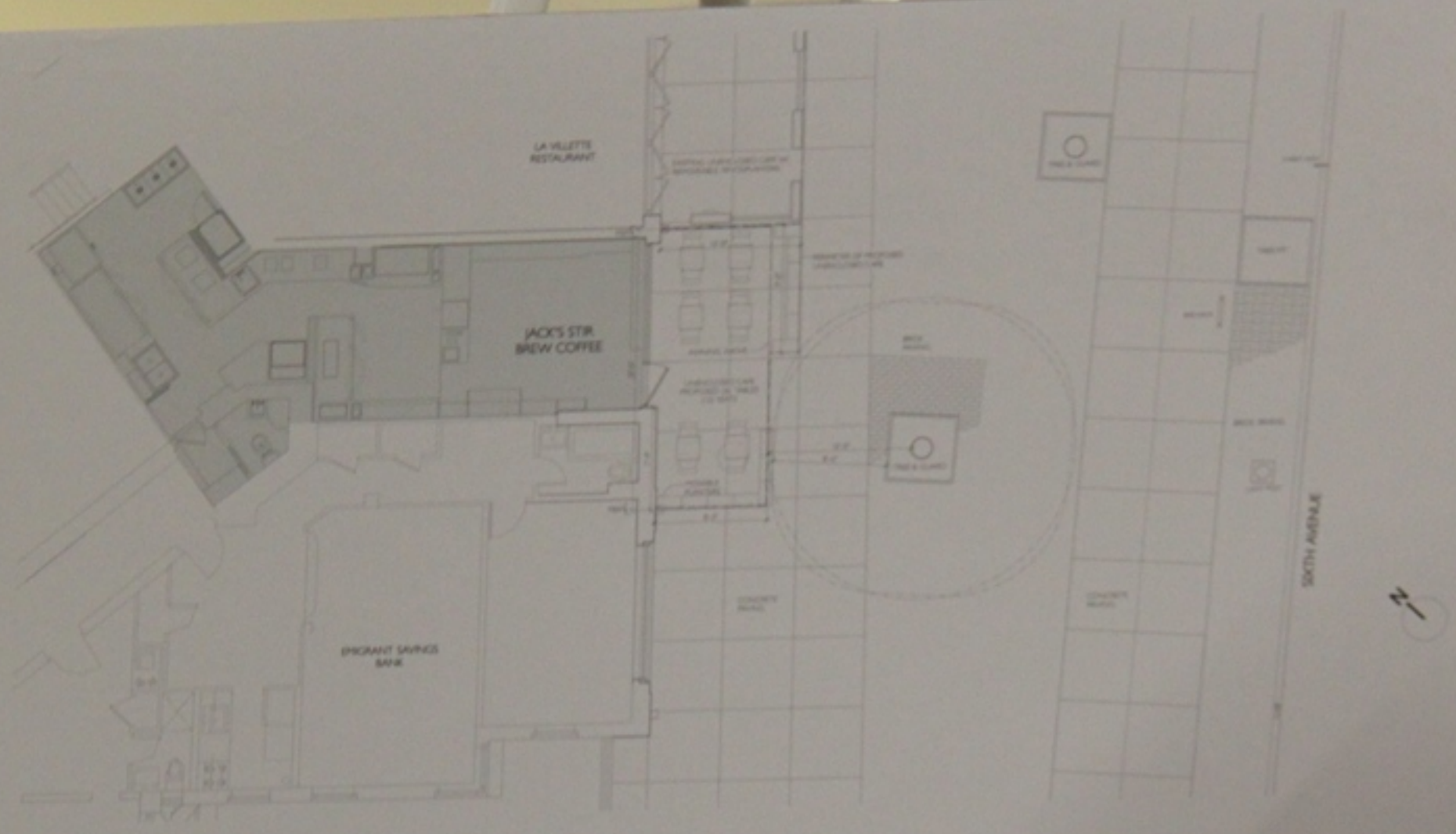
1 PARTIAL BUILDING PLAN SCALE 1/8" = 1'-0"