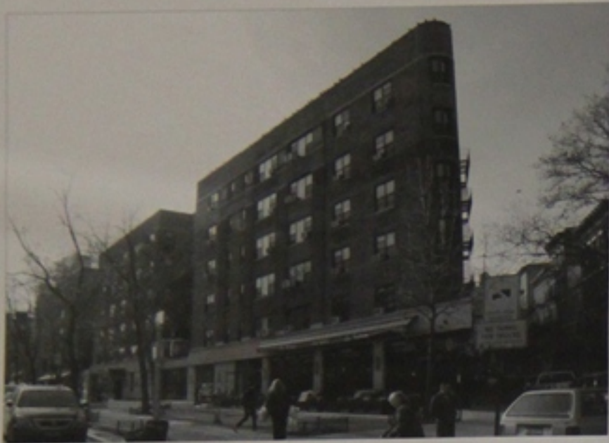
1 EXISTING VIEW CORNER 4TH AVE. & DOWNING ST.