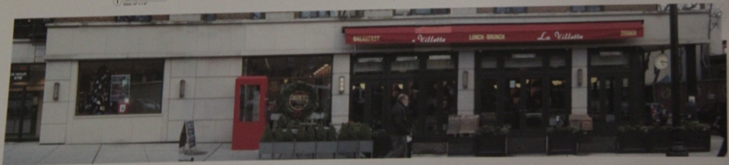
2 SIXTH AVENUE PARTIAL EXISTING ELEVATION