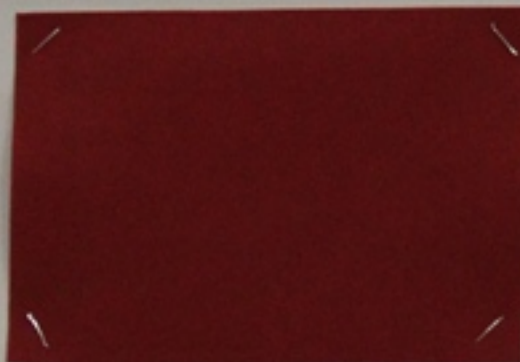
4 AWNING FABRIC