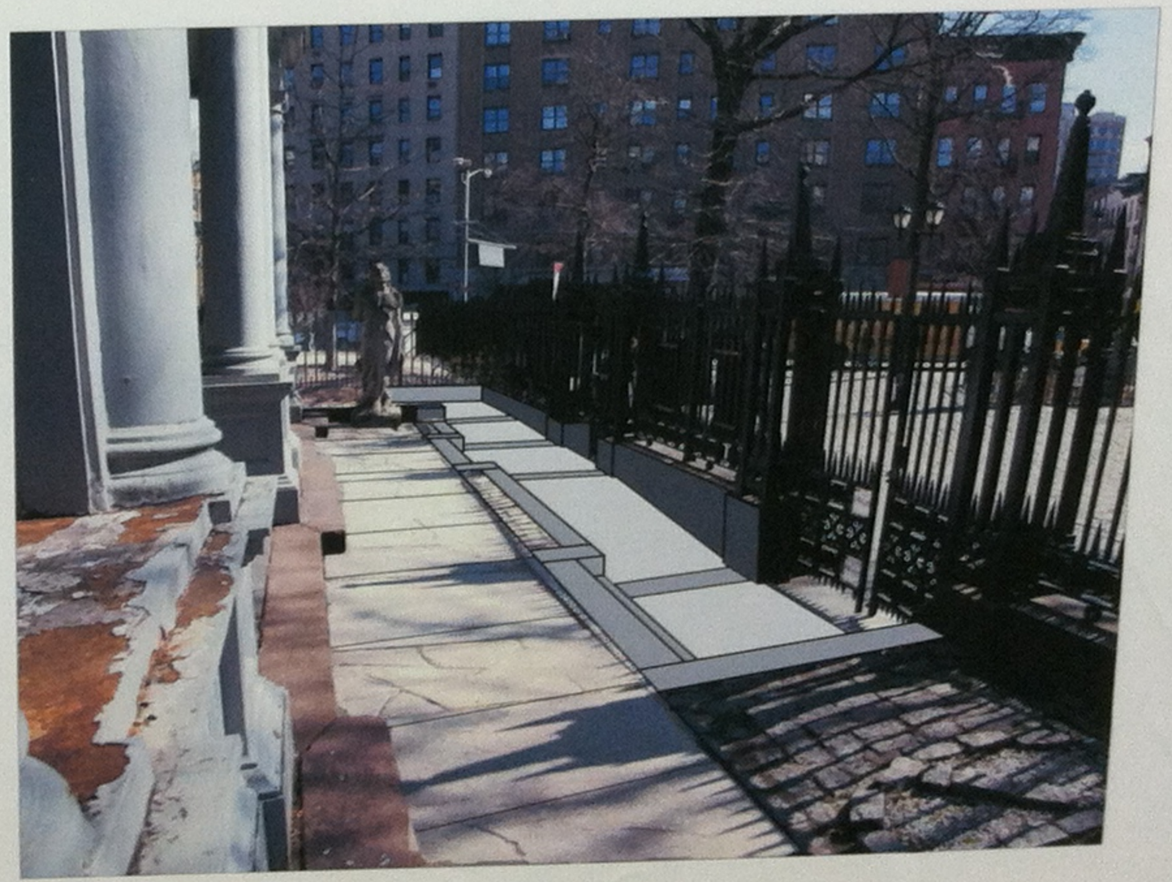
6 PROPOSED ENTRY

SCALE N.T.S. DRAWN BY DVE TITLE PROPOSED PHOTOS SHEET NUMBER A501.0