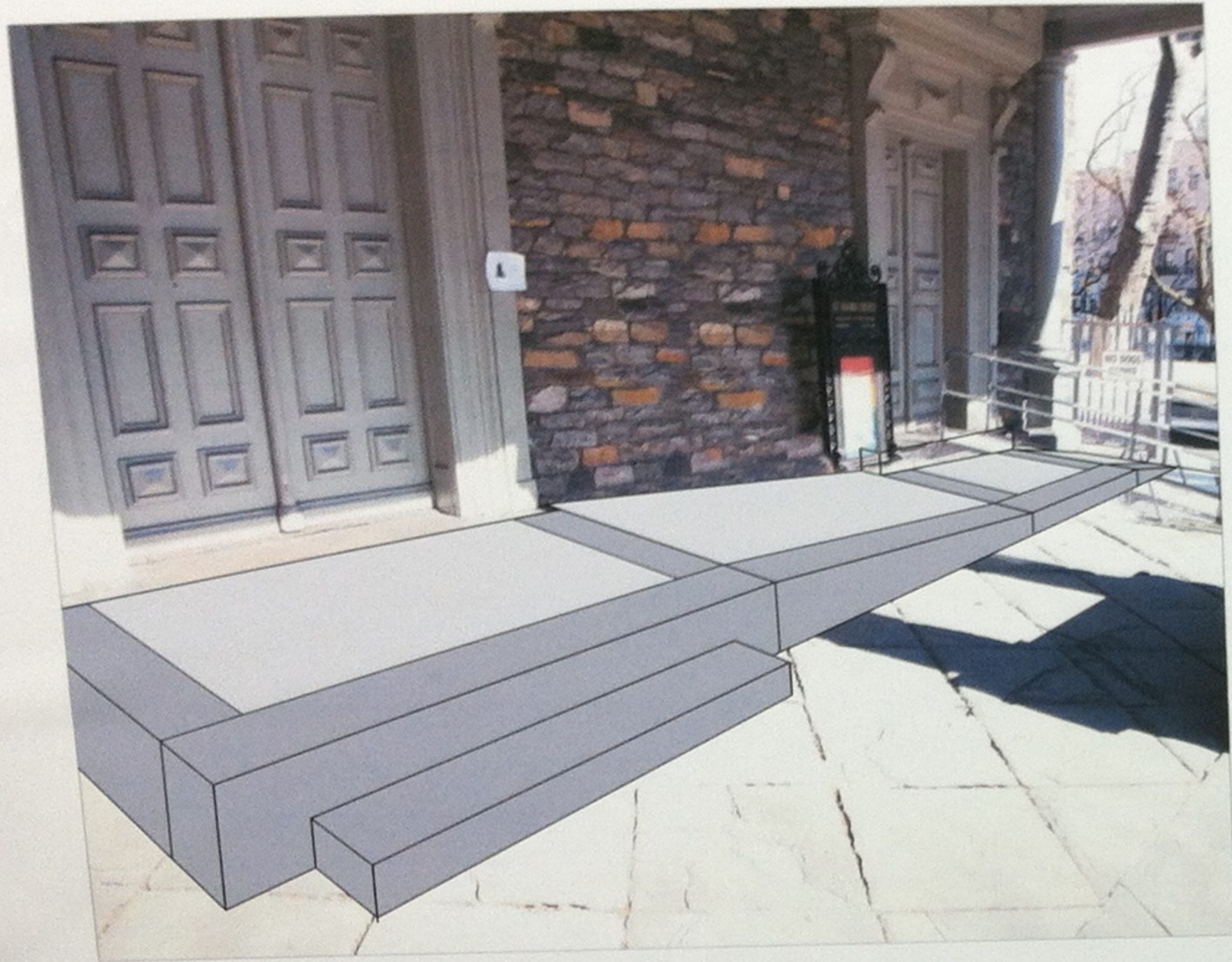
8 PROPOSED PORTICO