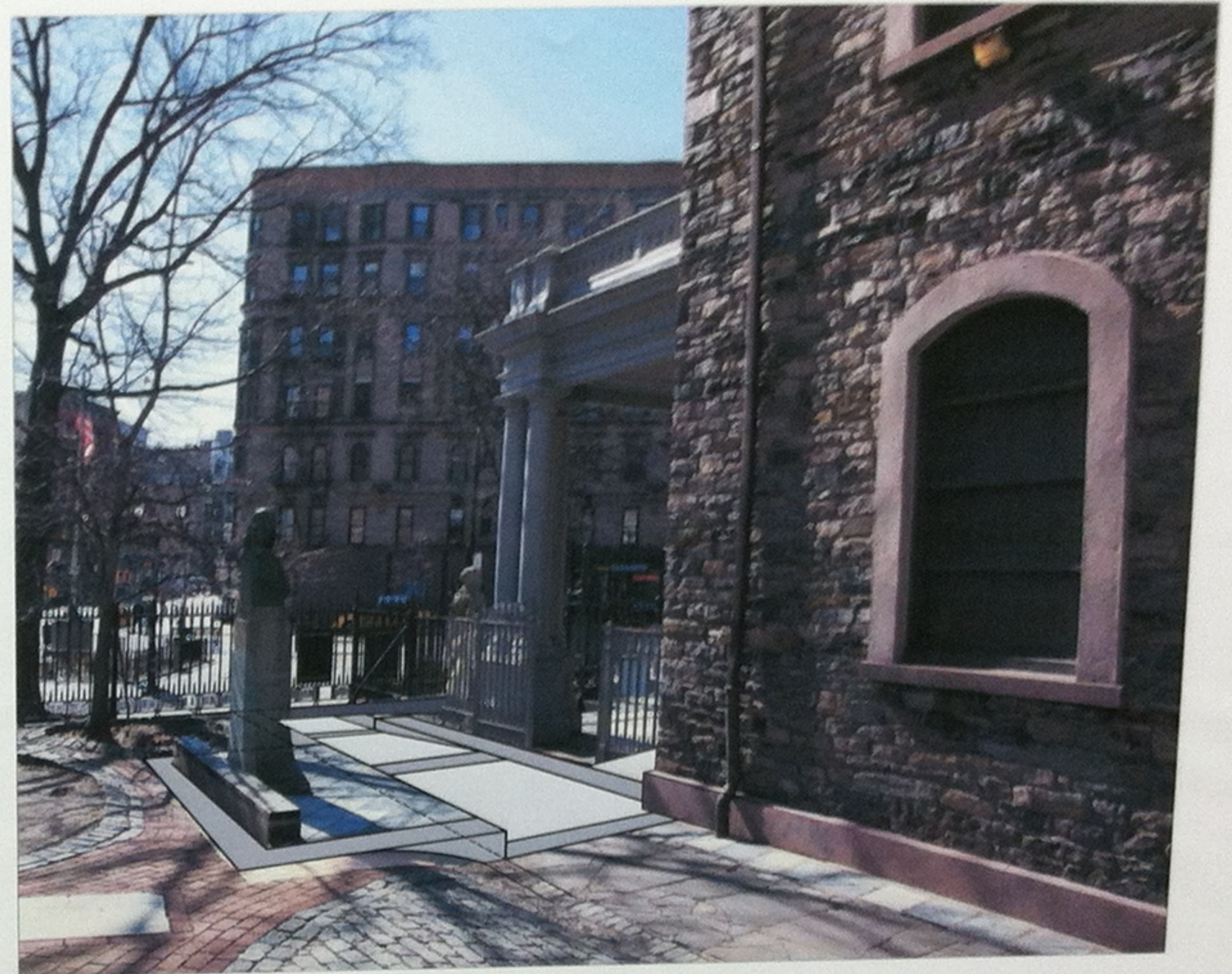
7 PROPOSED EAST ELEVATION