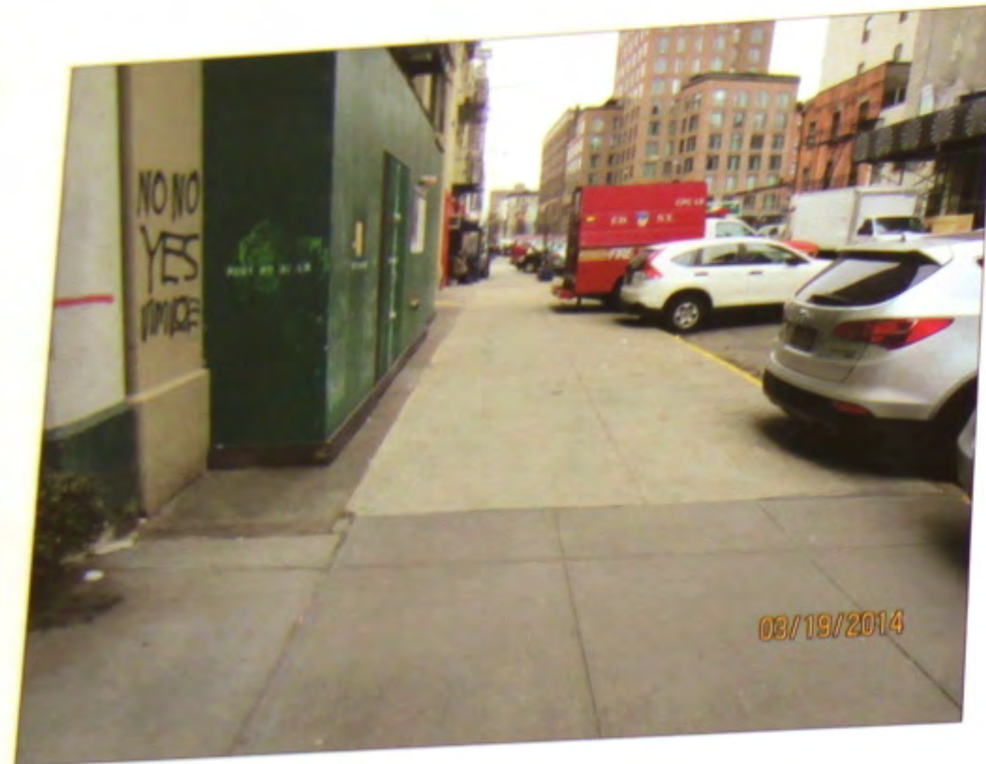
PHOTO 1 1 SCALE: NTS S-102 SIDEWALK LOCATION EAST FROM ADJACENT PROPERTY