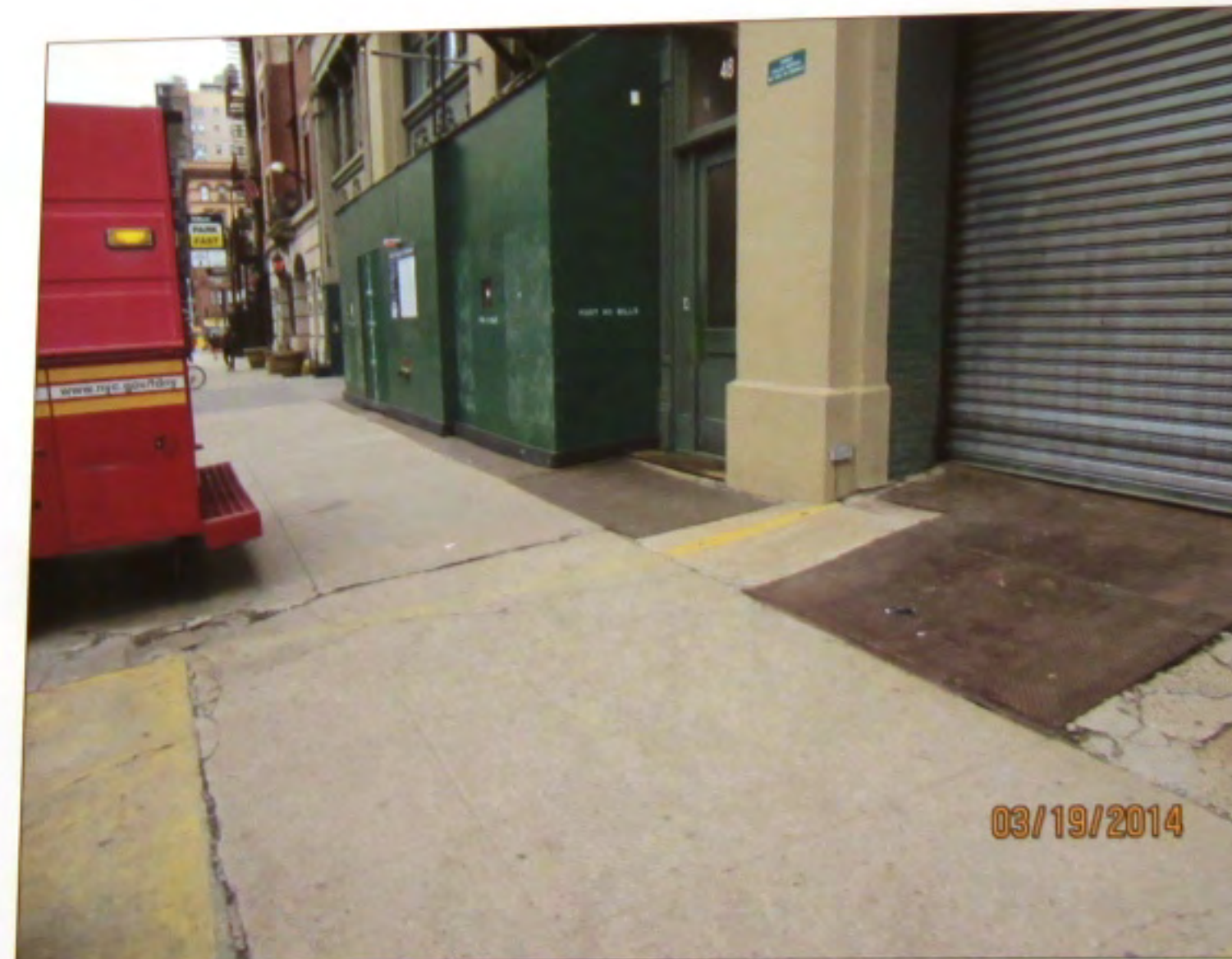
PHOTO 5 5 SCALE: NTS S-102 SIDEWALK LOOKING WEST IN FRONT AT BUILDING ENDING