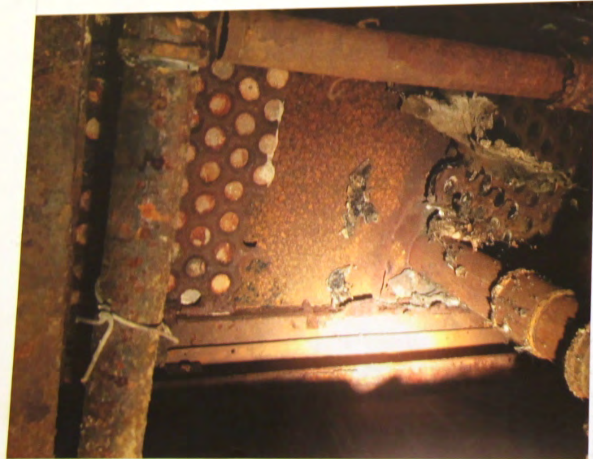
PHOTO 3 UNDERSIDE OF VAULT AT STANDPIPE PENETRATION