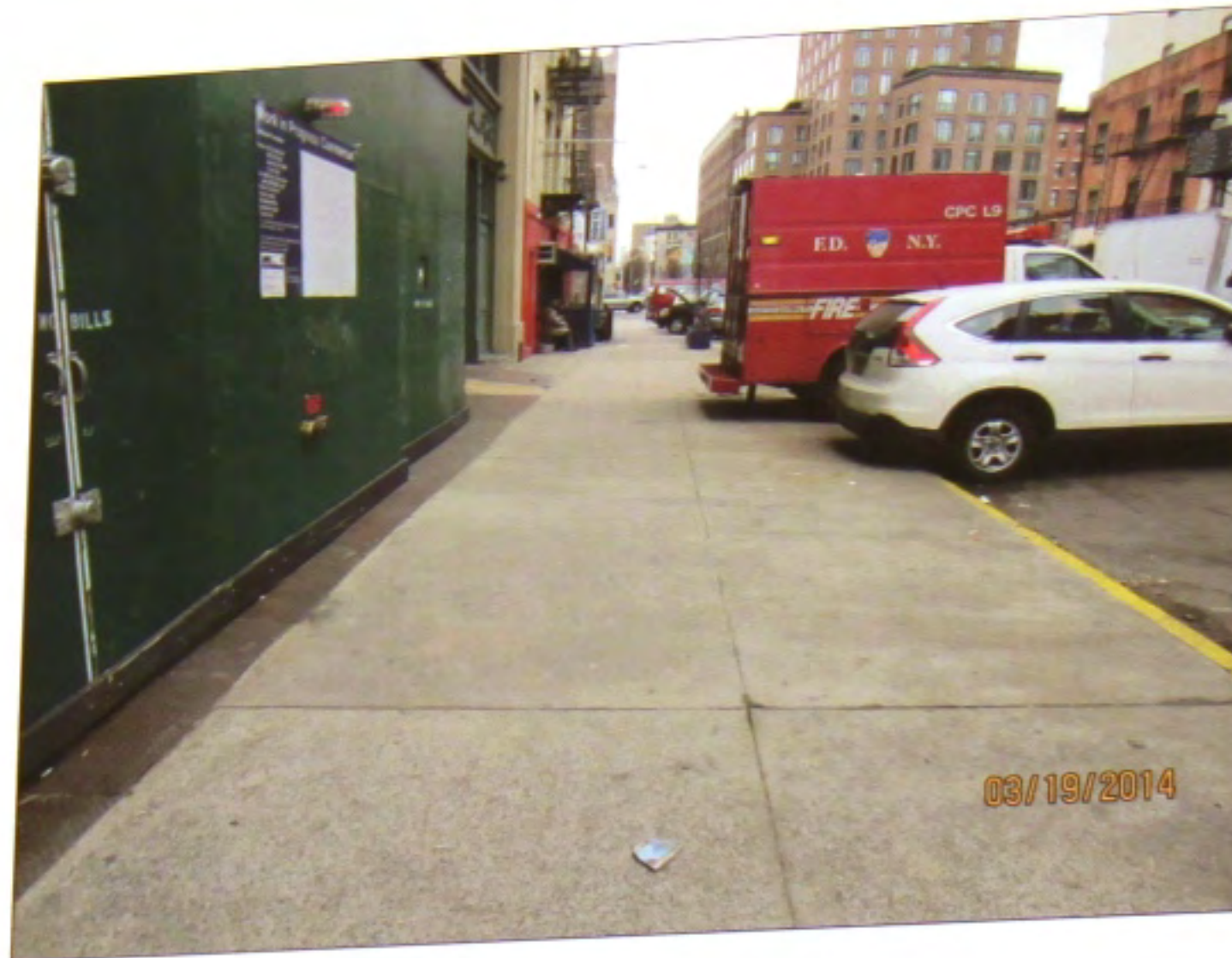
PHOTO 2 2 SCALE: NTS S-102 SIDEWALK LOCATION EAST FROM IN FRONT OF NEW RETAIL STORE