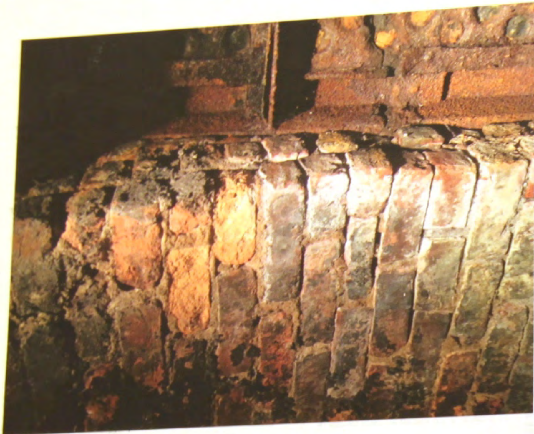
PHOTO 1 UNDERSIDE OF VAULT AT EDGE OF BRICK ARCH