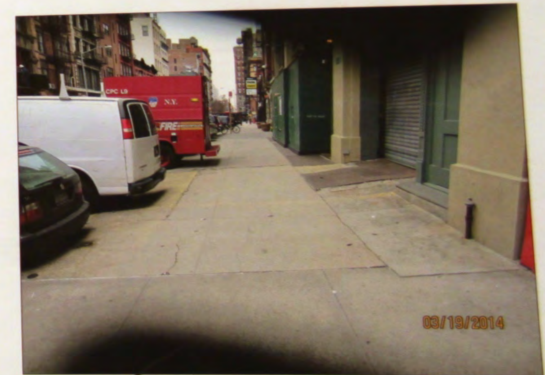
PHOTO 6 6 SCALE: NTS S-102 SIDEWALK LOOKING WEST FROM ADJACENT PROPERTY

FOR LOCATION OF PHOTOS SEE PLAN ON DWG. S-101