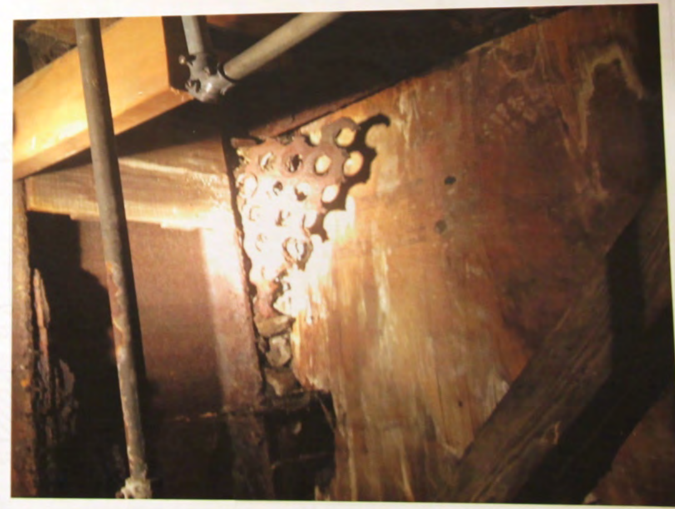
PHOTO 4 UNDERSIDE OF VAULT AT CONCRETE RAMP