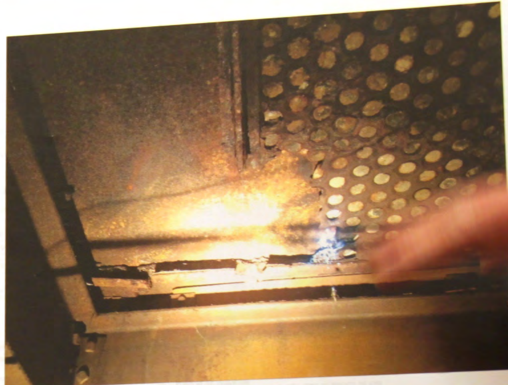
PHOTO 2 UNDERSIDE OF VAULT SHOWING STEEL PLATE AND A REMAINING PORTION OF A VAULT LIGHT