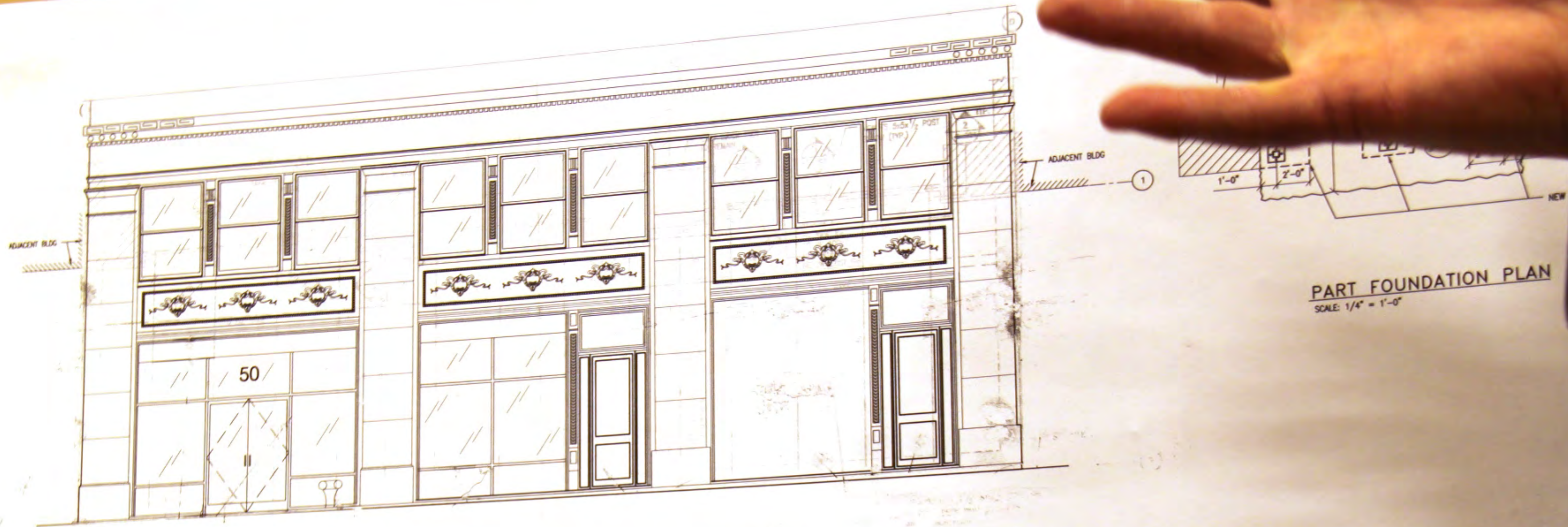
PART FOUNDATION PLAN SCALE: 1/4" = 1'-0"