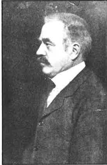
Stanford White in later years