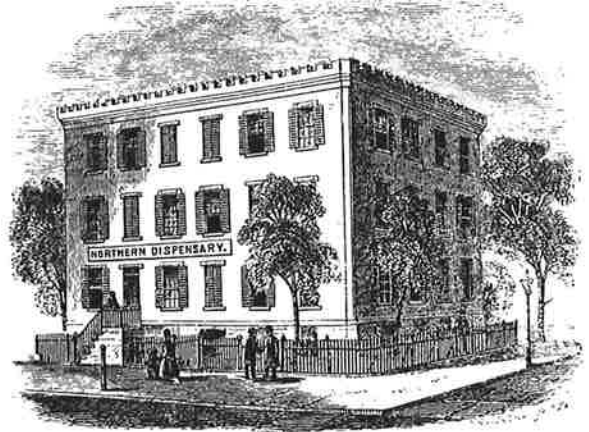
The Northern Dispensary in 1865. The Gothic Revival style battlement crowning the building, added with the third story in 1854, was subsequently removed (engraving from Valentine's Manual , 1865).

The Northern Dispensary was founded in 1827 by a group of private citizens "for the purposes of relieving such sick, poor and indigent persons as are unable to procure medicinal aid" residing in what was then "the northern district of the city." The clinic provided low-cost health services at no cost to the taxpayer, specializing exclusively in more recent years in complete dental care until it closed.