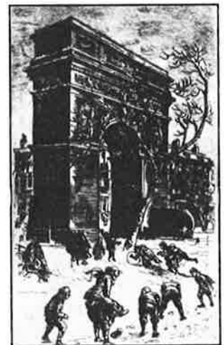
"Washington Arch" (1923) etching by John Sloan

A new walking tour on the subject of "Famous Artists of Greenwich Village" in May will focus on a number of painters and sculptors who lived in the Village or whose work remains here as an artistic legacy. Plans for the tour include visits to the studio of Gertrude Vanderbilt Whitney (now part of the New York Studio School), the former Tile Club, the Grey Art Gallery and the Salmagundi Club, the oldest professional artists club in