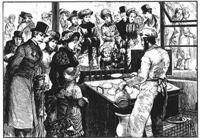
A Culinary Demonstration in 1882 (from Frank Leslie's Illustrated Newspaper )

Name _____ Street _____ City _____ State _____ Zip _____ Telephone _____