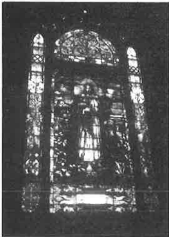
One of the stained glass windows