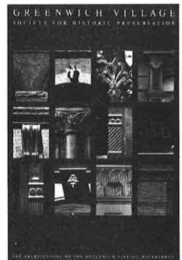
The Architecture of the Greenwich Village Waterfront poster.

Please make checks payable to Greenwich Village Society for Historic Preservation and mail to 47 Fifth Avenue, New York, N.Y. 10003. You may also purchase any of these items at the Society's office; please call 212/924-3895 to make arrangements. Proceeds benefit the Greenwich Village Society.