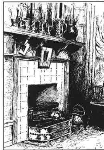
A fireplace in the Tile Club; drawing by A.B. Frost from The Book of the Tile Club , 1886.