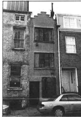
75-1/2 Bedford Street, where Edna St. Vincent Millay lived from November 1923 until June 1925. She had become the first woman to receive the Pulitzer Prize for poetry in 1923.