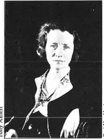
Edna St. Vincent Millay, 1933