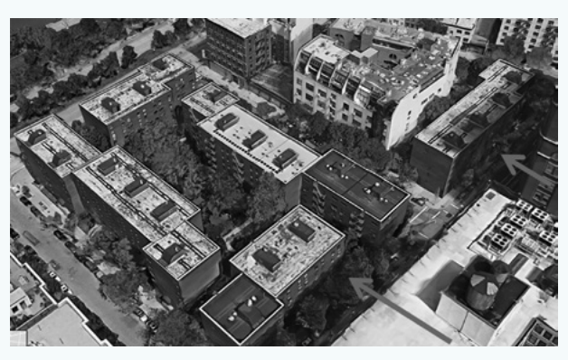
West Village Houses as seen from the air.

new buildings and additions, the approvals were still completely inappropriate. Now as part of the renovation work on several of the 'preserved' buildings in the row, the developer