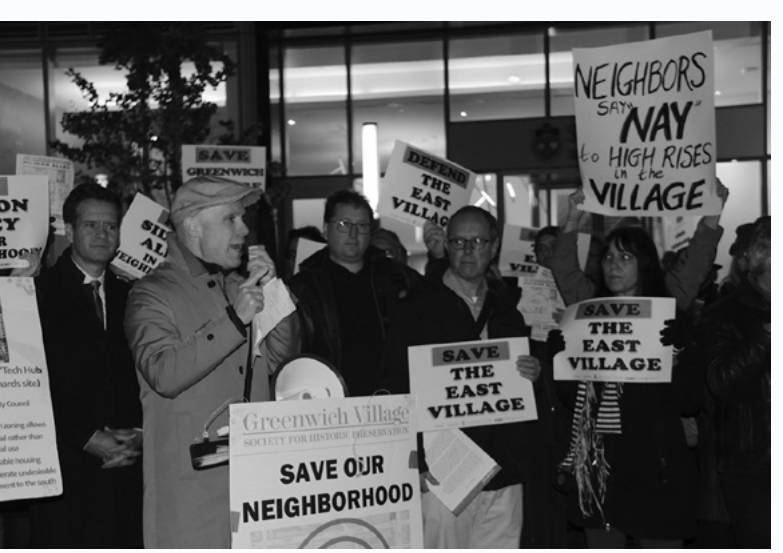
GVSHP led a rally calling for zoning protections to accompany any Tech Hub plan in November.

Public support will be needed at many hearings and meetings on this issue in 2018—see gvshp.org/savemyneighborhood for more info.