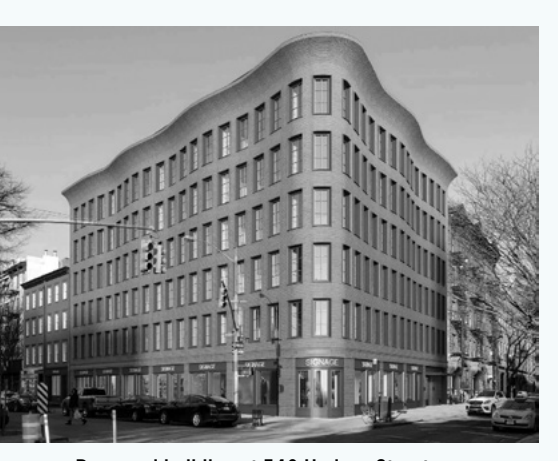
Proposed building at 540 Hudson Street.

The West Village has some of the strongest landmark and zoning protections of any place in New York City—much of which GVSHP has helped secure over the last fifteen years. But the neighborhood still faces some big preservation challenges: