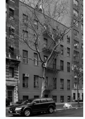
14 Fifth Avenue today.