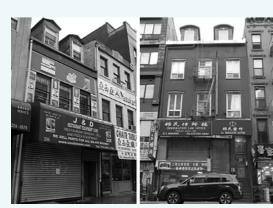
206 Bowery (I.) and 22 E. Broadway

designation about five years ago, but the Landmarks Preservation Commission (LPC) never rendered a final decision. Because of a law passed by the City Council in 2016 and signed by the Mayor, potential landmarks like these are automatically "decalendared" or dropped from consideration as potential landmarks, with all temporary protections from demolition and alteration stripped, if the LPC does not act within a proscribed time frame. If the LPC did not act by the first of the year, this is exactly what would happen. GVSHP has urged the LPC to protect these historic houses, and helped mobilize the public to ask the same. As we go to press, the LPC has not yet acted. See gvshp.org/federals.