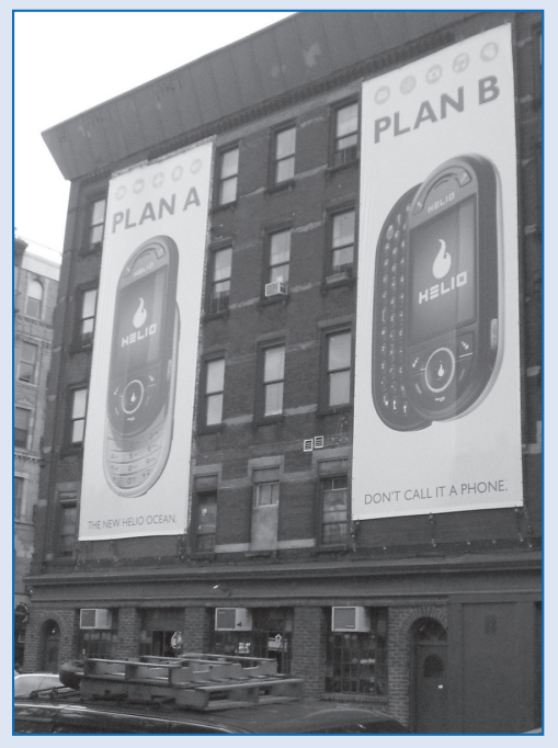
108 Avenue B, one of several locations from which GVSHP was able to get illegal billboards removed; many more remain, however.

GVSHP has established an illegal billboard tracking and monitoring system to report and seek the removal of these signs throughout our neighborhood. Though we face an enforcement and adjudication system that is extremely lax in its response to illegal billboards, we have succeeded in getting billboards, we have succeeded in getting billboards removed in the Meatpacking District, the East Village, and Noho, and in getting violations issued against dozens more throughout the Village. But many, many more remain. Call or e-mail us to report an illegal billboard; see www. gvshp.org/GansvBlbd.htm