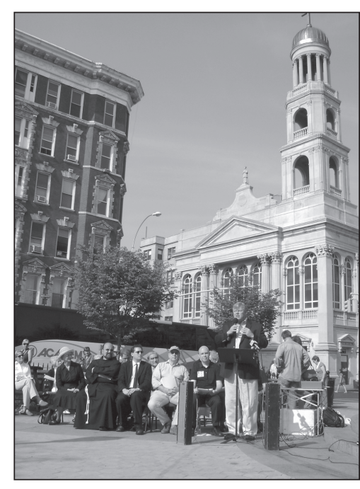
Columbus Day event celebrating the release of GVSHP's "Italians of the South Village" report; State Senator Tom Duane is speaking.

The South Village remains an incredible collection of 19<sup>th</sup> and early 20<sup>th</sup> century architecture, with cultural, social, and ecclesiastical institutions connected to the neighborhood's proud history of immigrant struggle, cultural innovation, and political ferment. But that history is increasingly threatened by demolitions and inappropriate