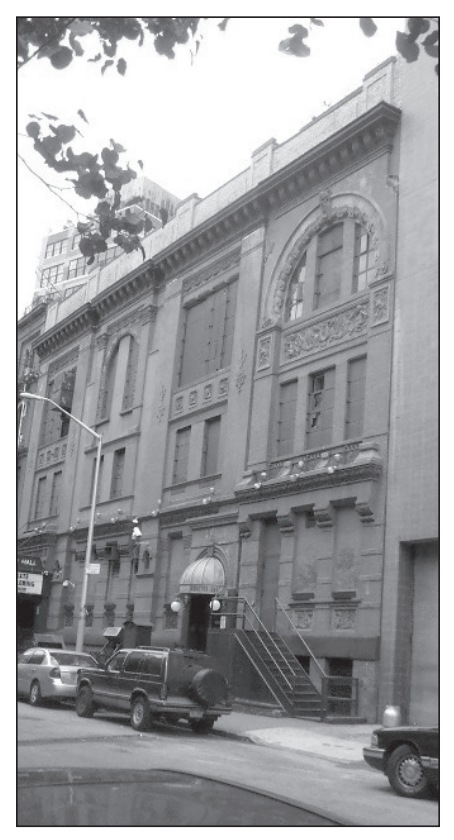
Webster Hall in the East Village, which GVSHP researched and proposed for landmark designation.