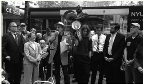
Elected officials and NYU faculty joined GVSHP for a rally this fall urging the courts to uphold our victory in the NYU case.

In 2006, GVSHP submitted its proposed South Village Historic District to the City, encompassing about 750 buildings on more than 30 blocks south and southwest of Washington Square. The proposal gained widespread support, and the City initially reacted