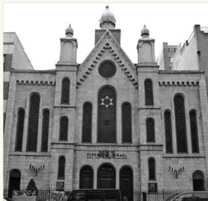
Tifereth Israel Synagogue

GVSHP and our partners at the Two Boots Foundation also marked two treasured East