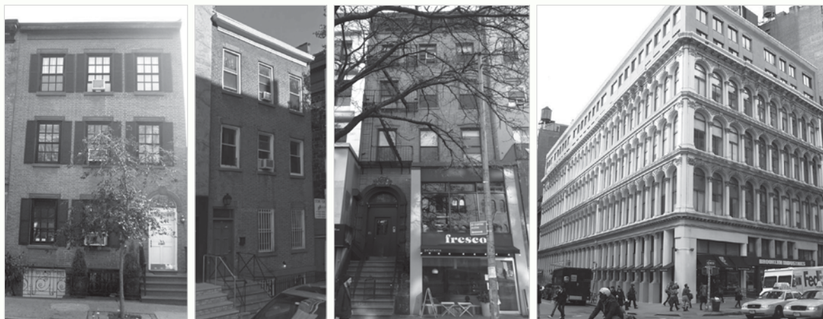
(l. to r.) 57 Sullivan Street, 2 Oliver Street, 138 Second Avenue, and 801-807 Broadway—just four of the nearly one hundred sites the Landmarks Preservation Commission planned to ‘de-calendar’ en masse.

against the plan, urge the Mayor to intervene (the Chair of the Landmarks Preservation Commission and all its members are appointed by the Mayor), and explore legal options should the plan be approved. We met with senior staff at the Commission to let them know how strongly and fundamentally we opposed the plan, while offering to work with the Commission to find more appropriate and transparent ways to clear out their backlog