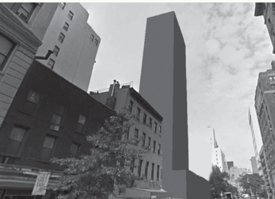
An image of the approximate size and massing of the planned new tower on the Bowlmor site.

These measures also require approval by the City, which takes many months, usually years. Thus while rezoning or landmarking proposals are highly unlikely to affect the planned development at 110 University Place, they could affect other future plans in the area. Without changes, more towers 300 feet or taller could be erected, containing hotels or dormitories, not just residences. Preventing this is a top priority for GVSHP. See gvshp.org/univpl for more info or how to help.