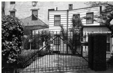
121 Charles Street

This past summer the beloved “Cobble Court” house at 121 Charles Street (Greenwich Street) was advertised for sale as a “blank development slate” for $20 million, creating a huge public outcry. But in fact the house lies within the Greenwich Village Historic District, and thus no changes, much less new development, are possible without a rigorous public review process and approval by the Landmarks Preservation Commission (LPC) as “appropriate” for the historic