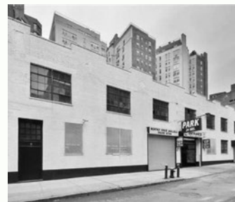
11-19 Jane Street

public of the scheduling of hearings and how to submit testimony, and advocate for appropriate outcomes in each case.