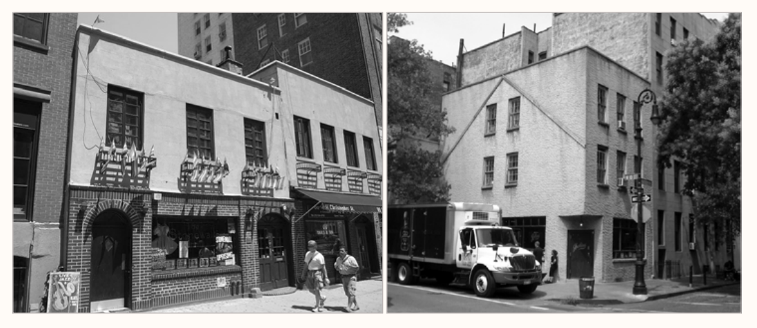
(I. to r.) Stonewall Inn, 51-53 Christopher Street; Julius Bar, 159 West 10th Street

This year, after a letter-writing campaign and a planned press conference in front of the Stonewall, the City finally announced in late May the site would be considered for landmark designation. As we go to press, a final vote on landmarking has not yet been set, and no commitment has yet been made on the three other sites. If designated, Stonewall would be the first site landmarked by New York City primarily for significance to LGBT history. Great progress is being made, but we still have more to do.