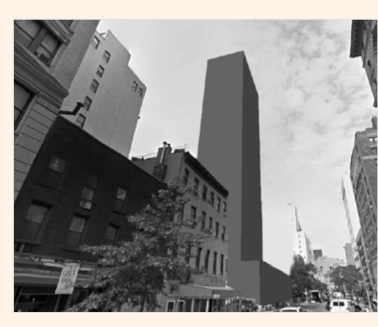
Image of the approximate size and massing of the planned tower at Bowlmore site.

That's exactly what's planned for the Bowlmor site at University Place and 12th Street, where demolition is underway and a 308 ft. tall tower is set to replace it. In response, GVSHP is pushing for a rezoning of the area with reasonable height limits, and is studying the area for possible landmark proposals.