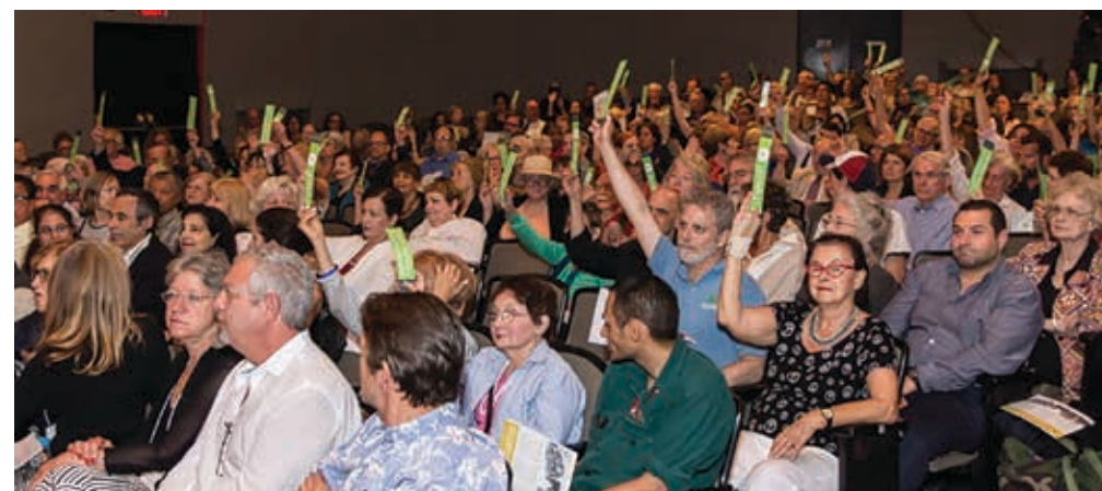
Support from hundreds of individual GVSHP members, pictured here at our 2013 Annual Meeting, funds the majority of the organization's work.