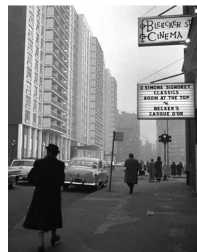
Bleecker Street Cinema, 1965.