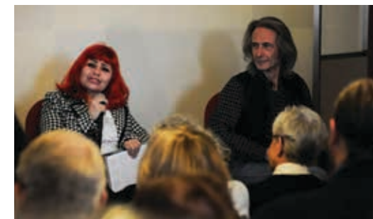
Penny Arcade and Lenny Kaye reading their contributions from Greenwich Village Stories at The Writers Room.