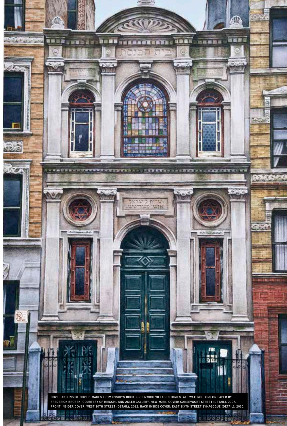
COVER AND INSIDE COVER IMAGES FROM GVSHIP'S BOOK, GREENWICH VILLAGE STORIES. ALL WATERCOLORS ON PAPER BY FREDERICK BROSEN. COVER: GANSEVOORT STREET (DETAIL), 2007. FRONT INSIDER COVER: WEST 10TH STREET (DETAIL), 2012. BACK INSIDE COVER: EAST SIXTH STREET SYNAGOGUE (DETAIL), 2010.

Return this form with your check to: Greenwich Village Society for Historic Preservation , 232 East 11th Street, New York, NY 10003.