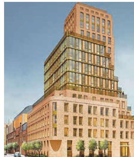
Proposed tower at St. Luke's; a slightly revised version was approved.

showing how delays and other changes in the practices of the Landmarks Preservation Commission have allowed unscrupulous developers to demolish or compromise historic structures before they can be landmarked. GVSHP coupled the report, which garnered significant media attention and support in the preservation community, with recommendations for systemic reform which would prevent such losses in the future.