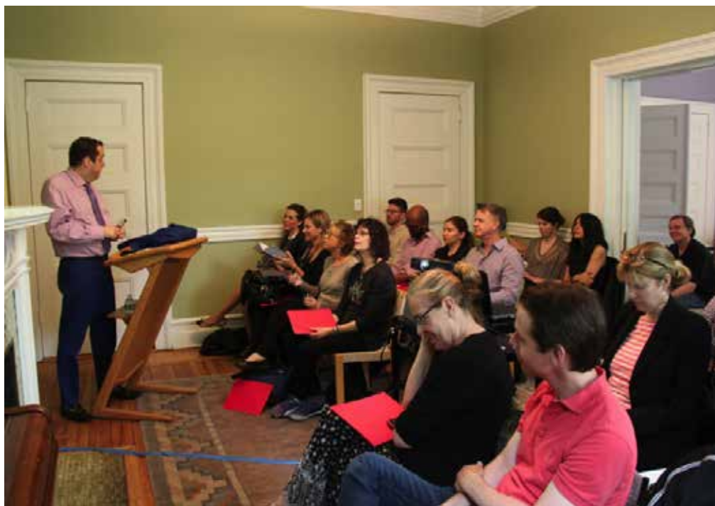
Continuing Education Program, with classes at GVSHP (l), and in the field (right-facing page).

Our Continuing Education program, conducted in conjunction with our Brokers Partnership, nearly quadrupled the level of participation by real estate professionals over the prior year. Classes covered topics including Fair Housing law, the architectural vocabulary of Greenwich Village, zoning, and the basics of tenement design.