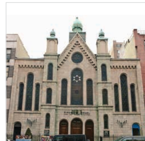
Tifereth Israel Synagogue

GVSHP also pushed for landmark designation of the Tifereth Israel Synagogue at 334 East 14th Street (1866), which was first considered for landmark designation in 1966 and whose future is uncertain since it was advertised for sale last year.