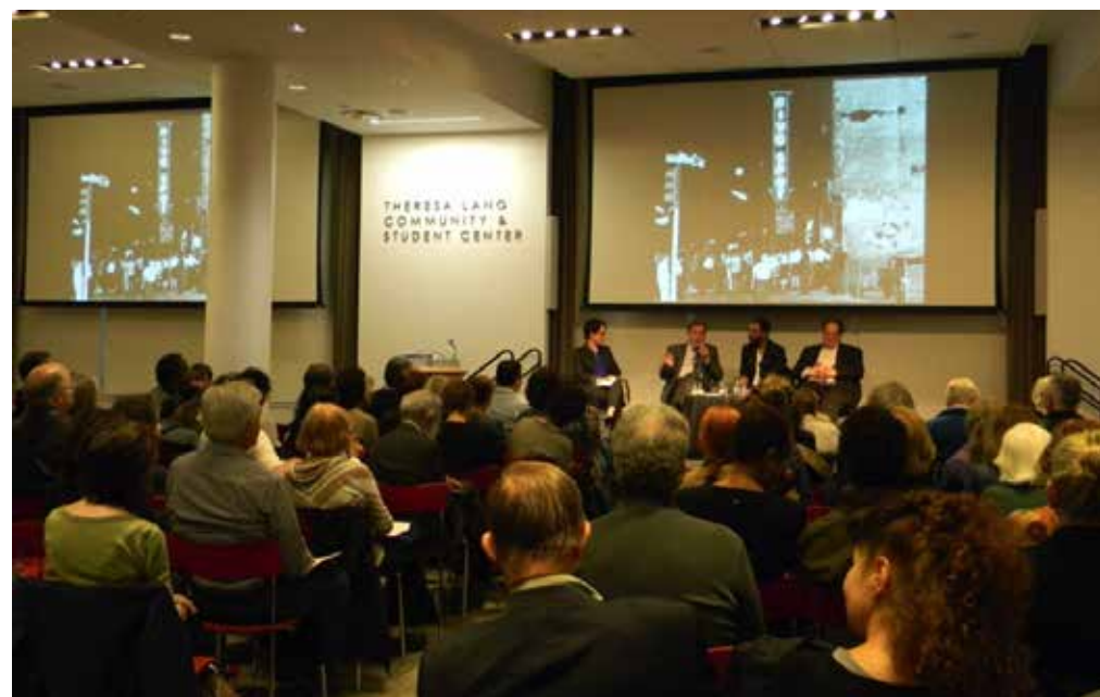
GVSHP Panel Discussion and Performance: The Shape of Jazz to Come: Downtown Jazz in 1959 and Now

“Thank you for organizing these lectures and making our neighborhood better.”