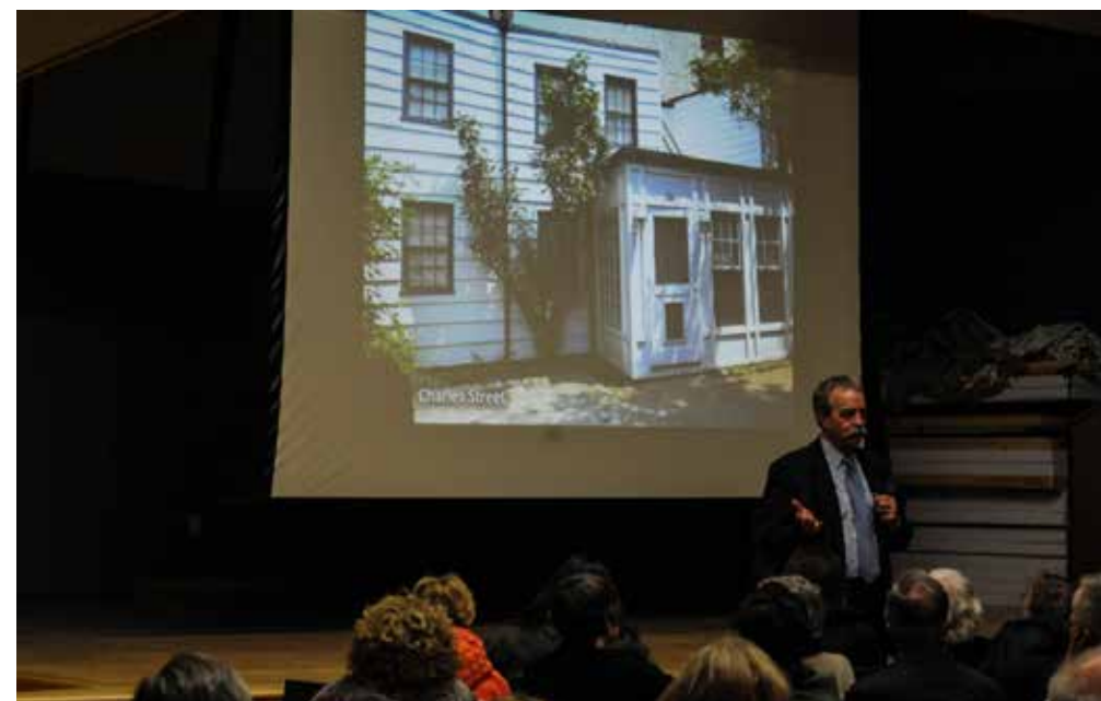
GVSHP Lecture and Slide Show: Wooden Houses of Greenwich Village

GVSHP's programming educates the public about historic preservation, and provides new insights and perspectives on the unique architectural and cultural heritage of Greenwich Village, the East Village, and NoHo.