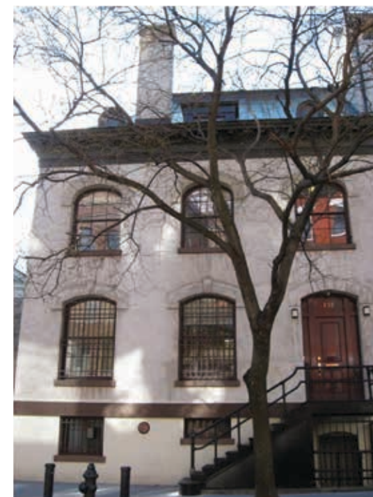
GVSHP's home in the Neighborhood Preservation Center, located in the Ernest Flagg Rectory of St. Mark's Church, 232 East 11th Street, in the St. Mark's Historic District.