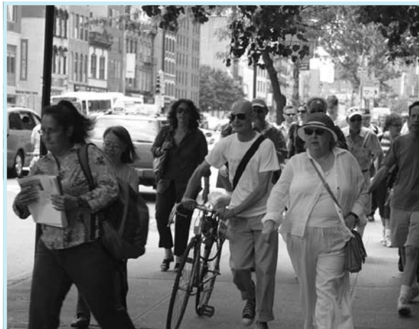
GVSHP walking tour of the East Village.

February 28- The Village & All That Jazz: Jazz at the Sixth Street Community Synagogue,