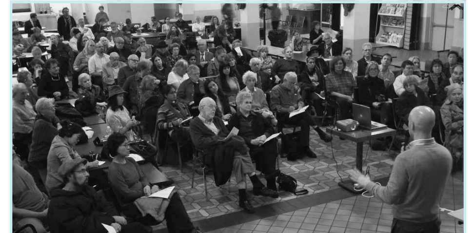
11 GVSHP conducts a Town Hall on NYU's proposed expansion plan.

In late October, the City gave final approval to a rezoning of six blocks in the Far West Village which GVSHP and fellow community groups led a two-year campaign to enact. The new zoning will prevent commercial overdevelopment in the area by imposing height limits and eliminating a zoning bonus for commercial (i.e. hotel) development. As a result, a proposal for a hotel development at Perry and Washington Streets was reduced in