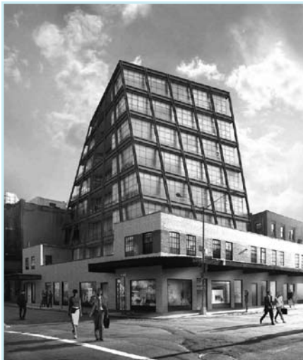
GVSHP opposed the proposed oversized addition to 837 Washington Street, which was subsequently greatly reduced in size.

The manner in which we reach out to our community has grown too. Our Children's Education program, the first of its kind in the City, is now