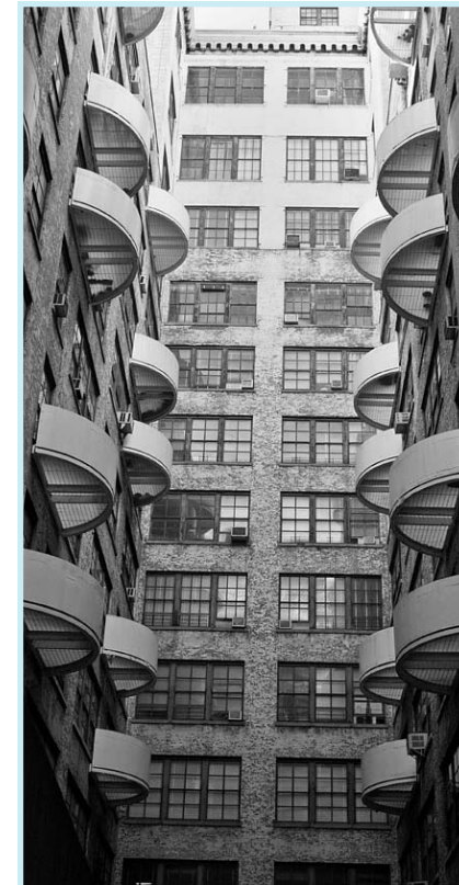
The Richard Meier-designed fire balconies at Westbeth, the subject of a first of its kind GVSHIP artists' loft tour in 2010.