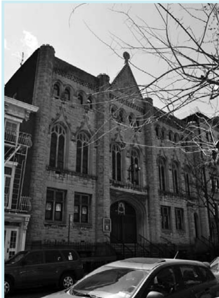
The Russian Orthodox Cathedral at 59 East 2nd Street – one of several buildings GVSHP successfully advocated be added to proposed East Village Historic Districts.

expanding the theaters and the vibrant street life of East Fourth Street over the last decade—efforts that culminated in the creation of the East Fourth Street Cultural District; P.E. Guerin, for keeping the increasingly rare craft of hardware