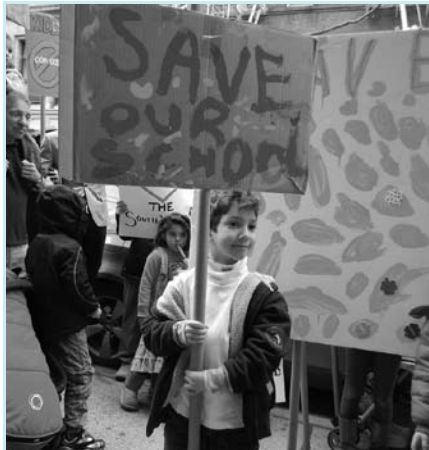
GVSHP's rally to preserve the Children's Aid Society buildings in the South Village.

GVSHP continued to lead the charge in response to NYU's massive proposed 20-year expansion plan, which will begin the public review and approval process in early 2012. Following a large community rally organized by GVSHP against the plan's 40-story tower on Bleecker Street, NYU dropped the building from its plan. Educating about the NYU plan and its potential impact upon the neighborhood, and advocating for alternatives, is a top priority for the Preservation