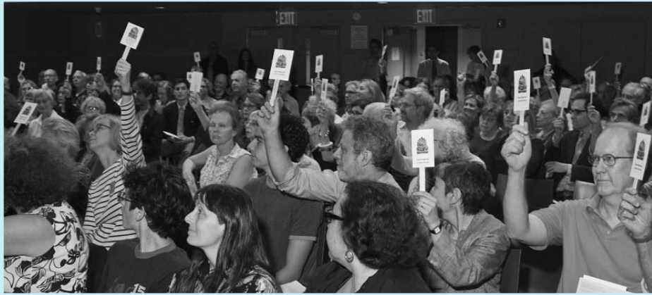
10 GVSHP members vote for new and returning trustees at the 2011 Annual Meeting.