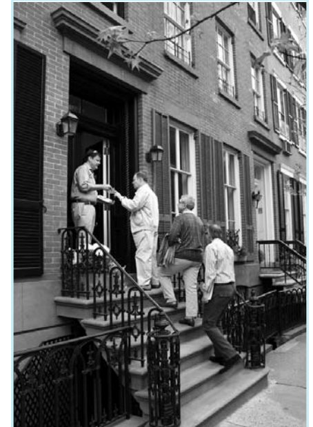
GVSHP's 2011 Benefit House Tour was our most successful yet.