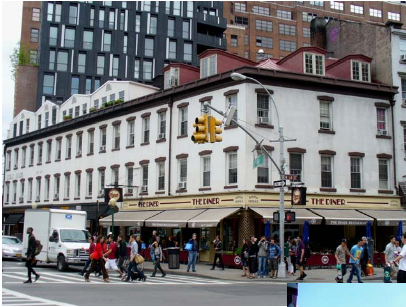
Photo 5. 44-54 Ninth Avenue showing dormers. Gregory Dietrich, photographer, 6/6/2013