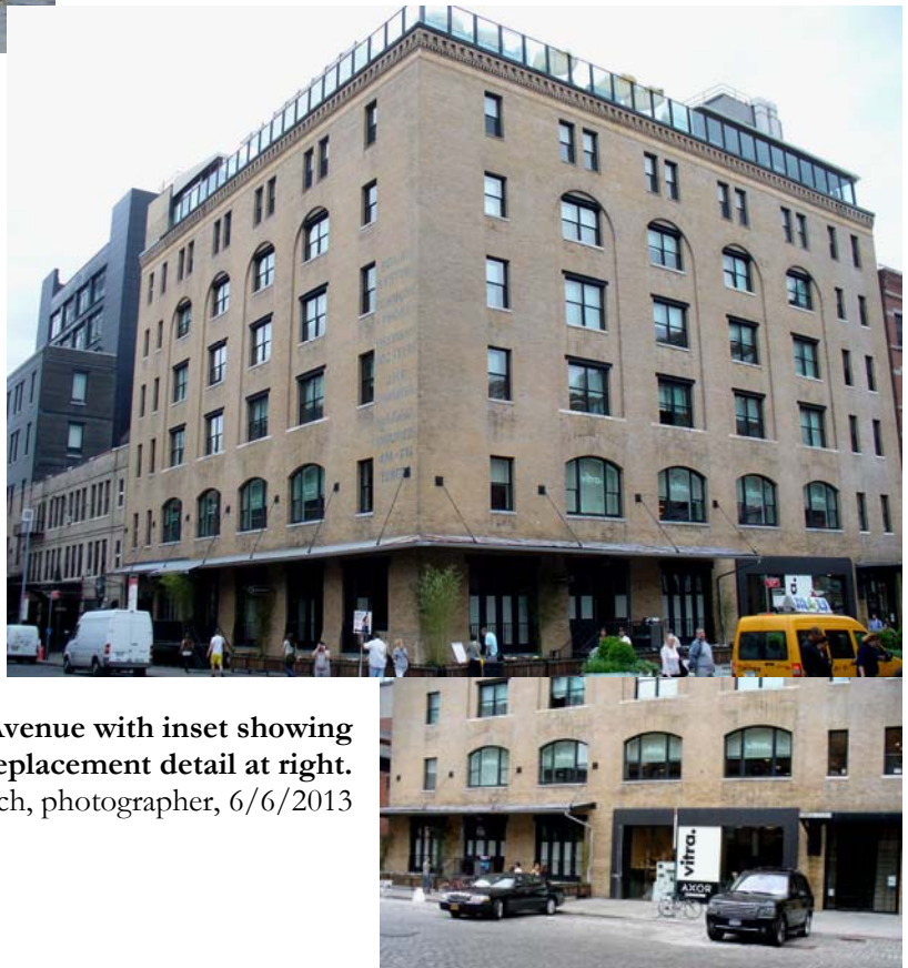
Photo 4. 29 Ninth Avenue with inset showing storefront replacement detail at right. Gregory Dietrich, photographer, 6/6/2013