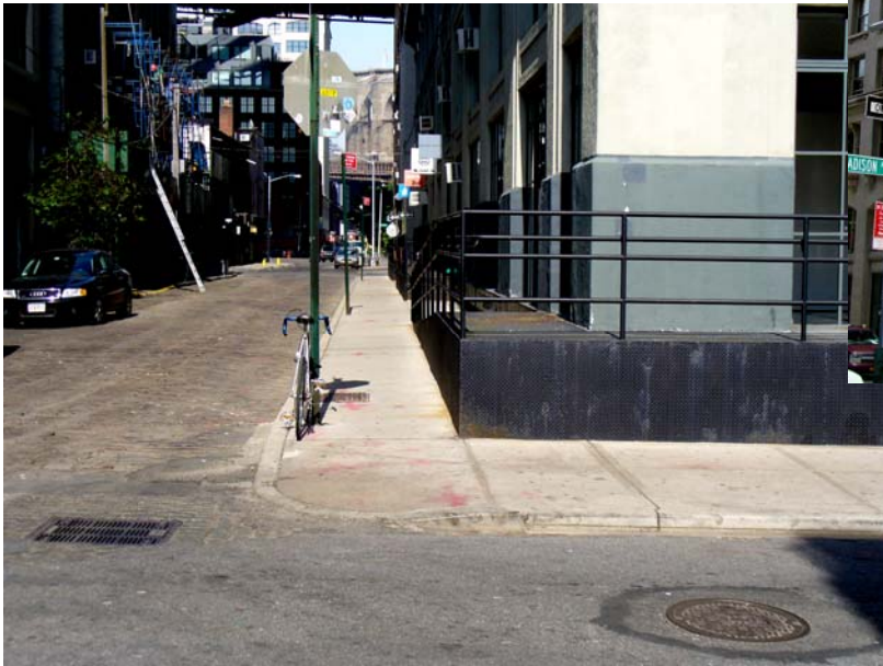
Photo 19. 20 Jay Street showing concrete replacement sidewalks. Gregory Dietrich, photographer, 6/6/2013