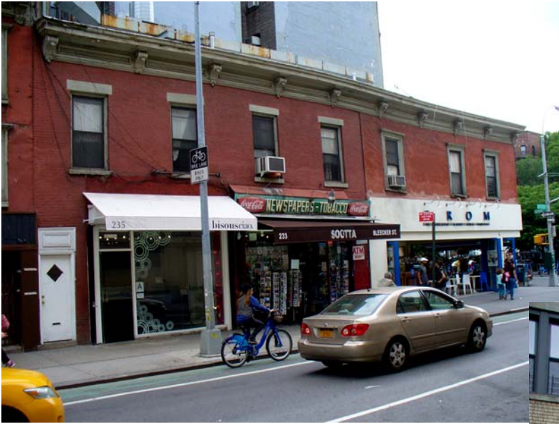
Photo 8. 233-237 Bleecker Street showing storefront replacements.