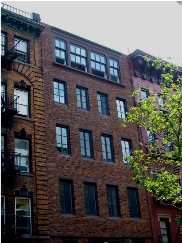
Photo 13. 331 E. 6 th Street after the loss of its historic townhouse. Gregory Dietrich, photographer, 6/6/2013