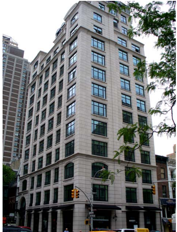
Photo 12. 861-863 Lexington Avenue after the loss of the former Kean House.