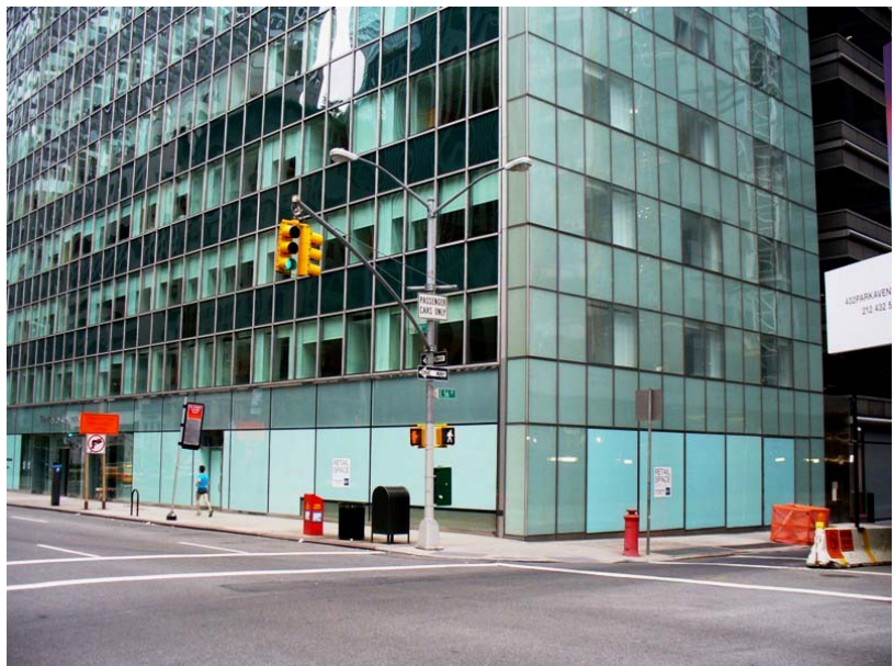
Photo 17. 430 Park Avenue showing currently vacant retail space after the loss of the former Hoffman Auto Showroom. Gregory Dietrich, photographer, 9/21/2013