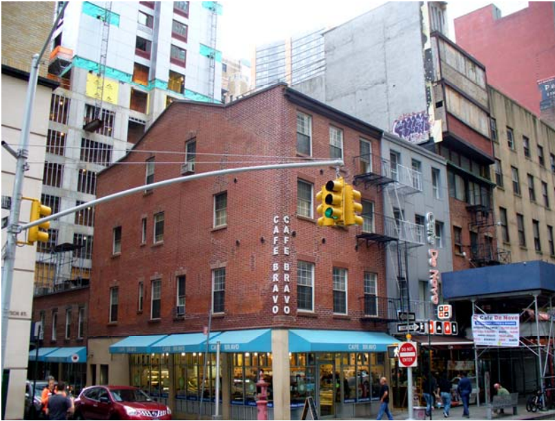
Photo 24. 94, 94½ and 96 Greenwich Street (left to right) showing multiple alterations, and rooftop addition to no. 96 under way. Gregory Dietrich, photographer, 9/21/2013