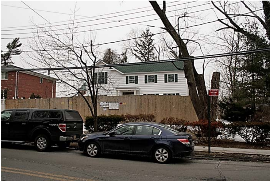
Photo 28. 38-60 Douglaston Parkway under construction.