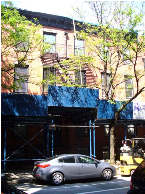
Photo 26. 80 E. 2 nd Street under construction. 6/14/2013