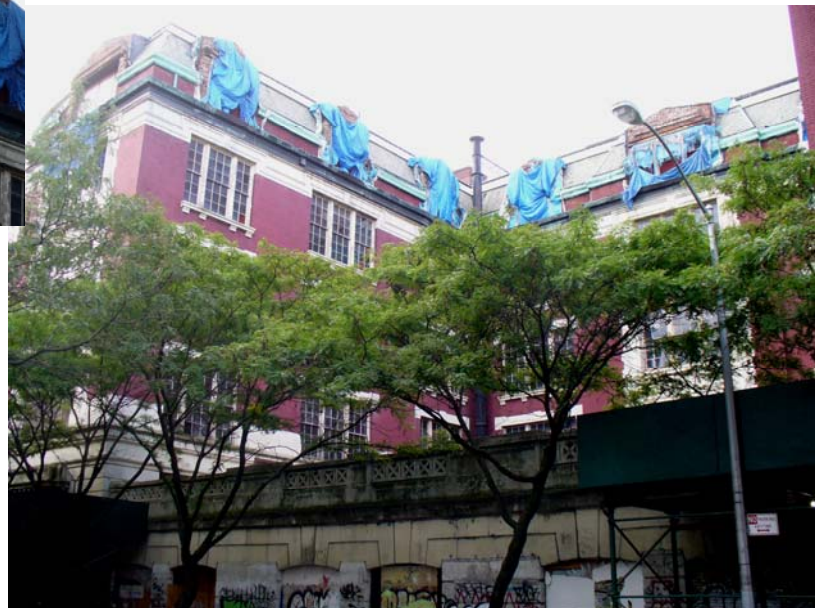
Photo 2. P.S. 64 showing destruction of terra-cotta ornamentation on E. 10 th Street facade. 9/21/2013