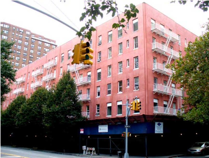
Photo 1. City and Suburban Homes Company: First Avenue Estates showing loss of ornamentation and cornice, and the introduction of pink stucco parging. 9/21/2013