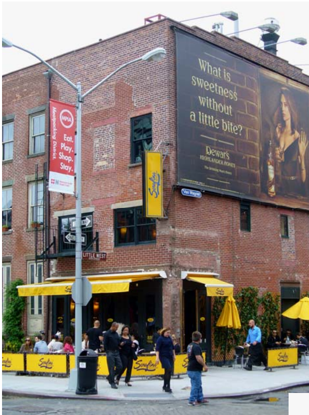
Photo 3. 7 Ninth Avenue showing flex-face sign. 6/6/2013