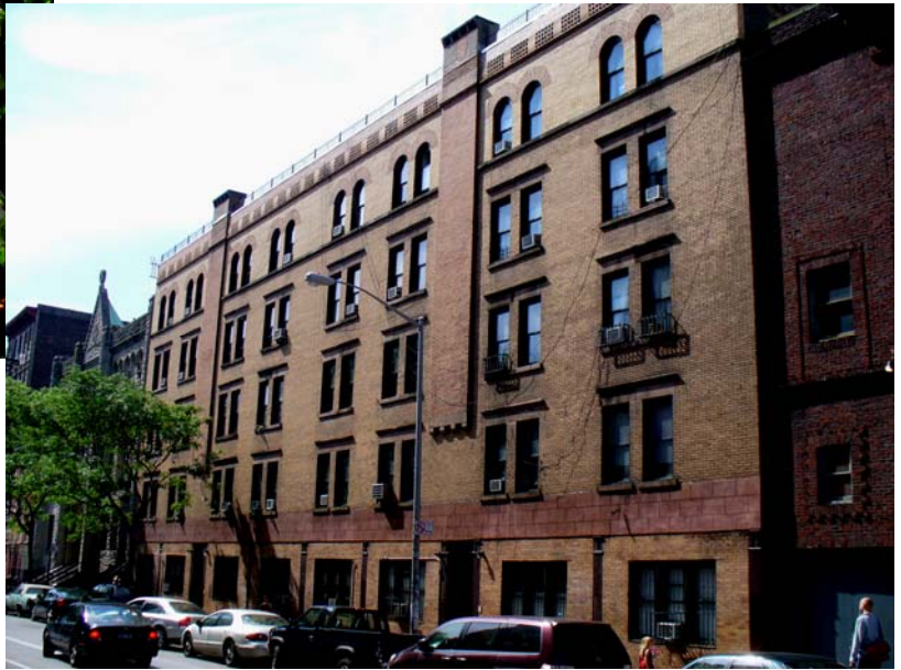
Photo 22. 51-55 E. 2 nd Street showing parapet repair and loss of cornice.