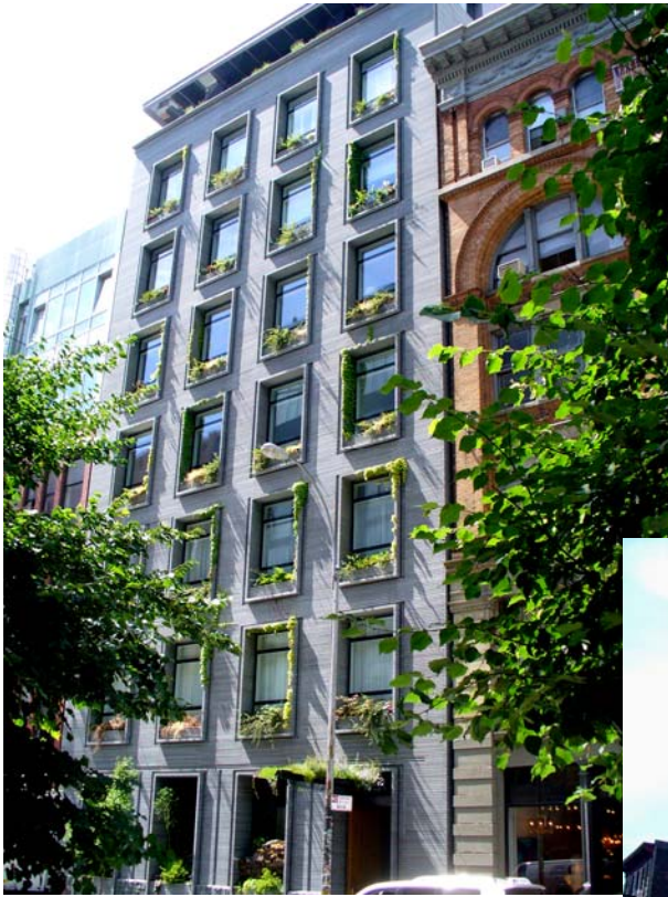
Photo 21. 41-43 Bond Street following its replacement.