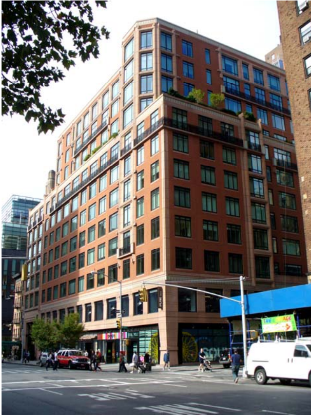
Photo 16. 342 Amsterdam Avenue after the loss of the former Dakota Stables. Gregory Dietrich, photographer, 9/21/2013