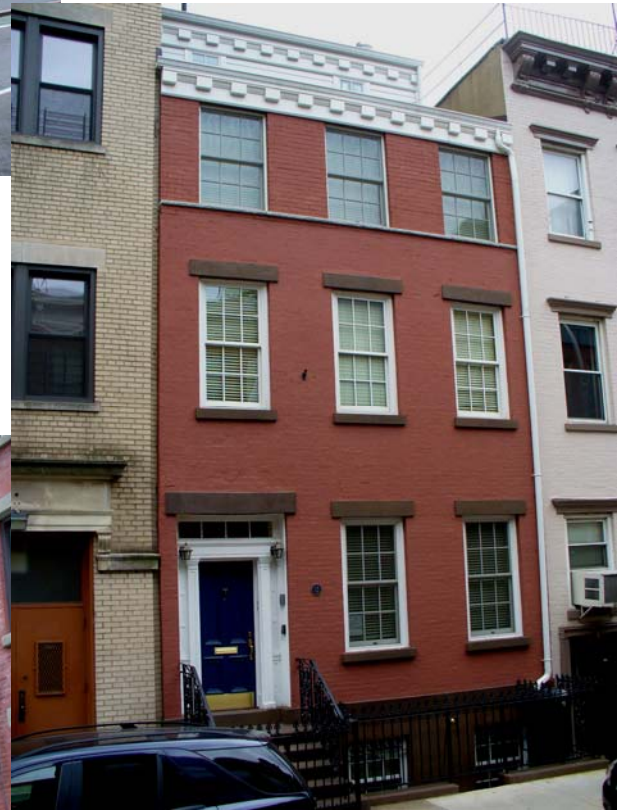
Photo 10. 7 Cornelia Street with inset showing storefront replacements. Gregory Dietrich, photographer, 6/6/2013