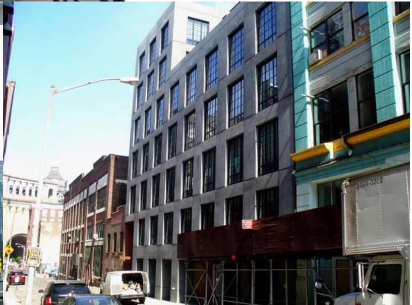
Photo 7. 45 Bond Street showing 2-story rooftop addition. 6/6/2013