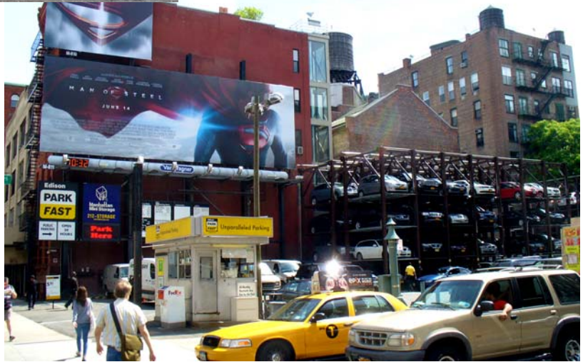
Photo 20. 30 Great Jones Street after the loss of the former Screw Factory. Gregory Dietrich, photographer, 6/6/2013