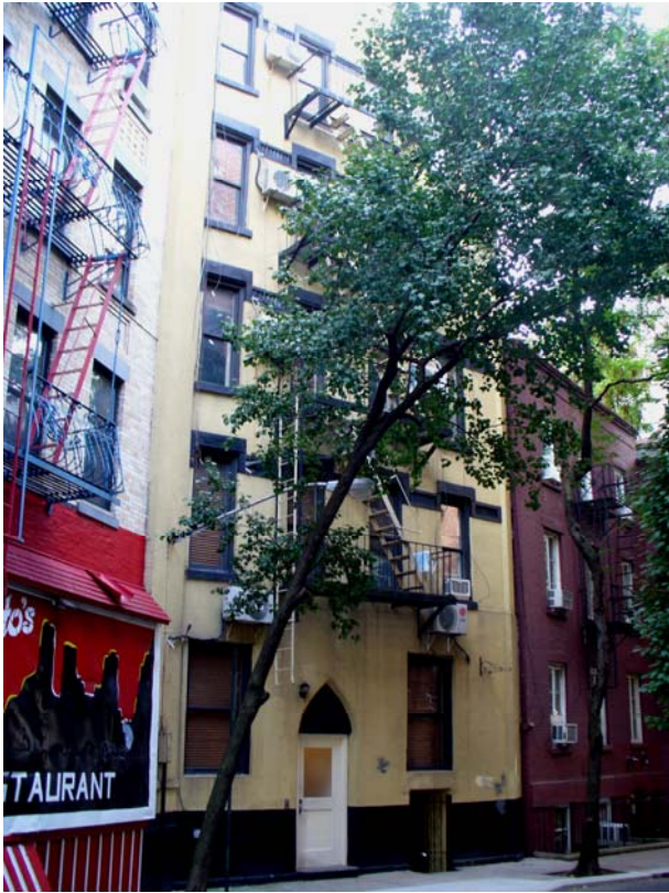
Photo 14. 9 Minetta Street before alterations to replace its front entrance and windows with a garage door. Gregory Dietrich, photographer, 9/21/2013