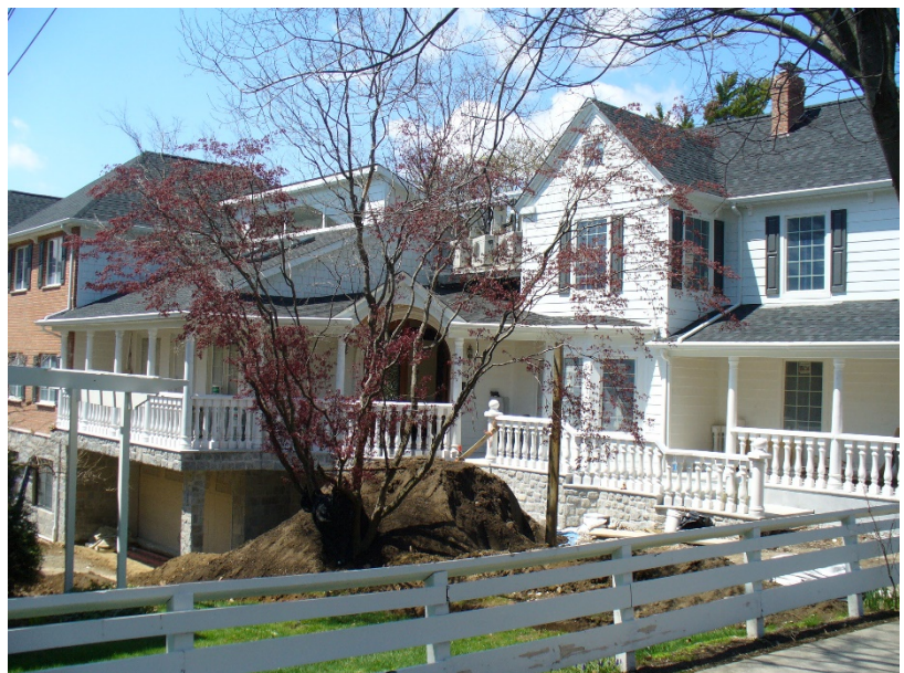
Photo 29. 39-12 Douglaston Parkway showing side and rear addition under construction.