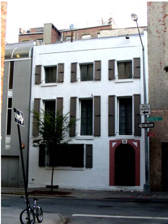
Photo 23. 16 Minetta Lane before the introduction of a 2½ story rooftop addition. Gregory Dietrich, photographer, 9/21/2013