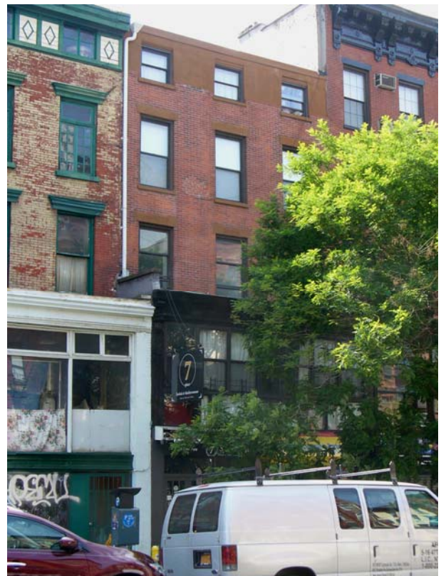
Photo 27. 82 Second Avenue showing loss of cornice and façade alterations. Gregory Dietrich, photographer, 6/6/2013