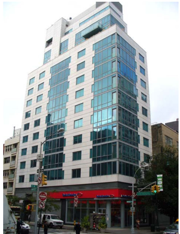
Photo 15. 36 E. 14 th Street after the loss of the former Paterson Silks Building. 9/21/2013