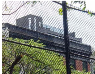
Photo 25. 315 E. 10 th Street showing inset with rooftop addition. 6/6/2013