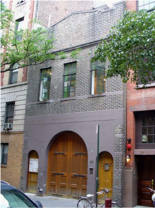
Photo 11. 23 Cornelia Street showing carriage door entrance surround missing horse-hoof details at their bases. Gregory Dietrich, photographer, 6/6/2013