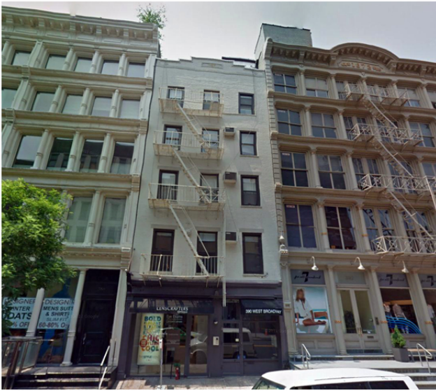
Highly altered rowhouse, 390 West Broadway (btw. Broome and Spring)