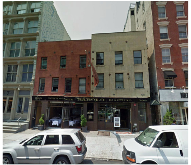
Highly altered rowhouses, 396 and 398 West Broadway (btw. Broome and Spring)