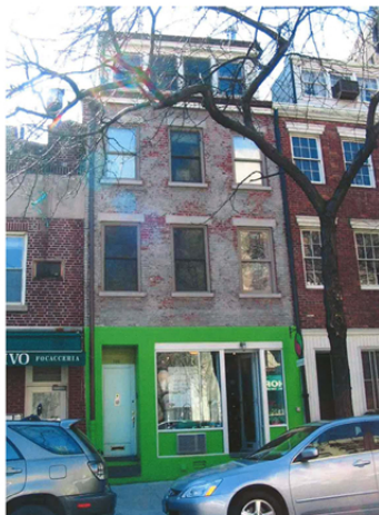
186 Spring Street, which the Landmarks Preservation Commission has refused to landmark. It contains many more intact historic details than the above structures.