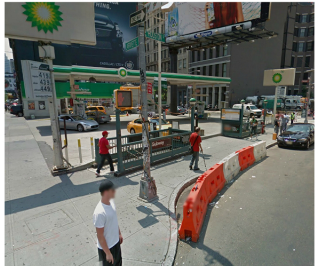
Gas Station and Houston and Lafayette Streets