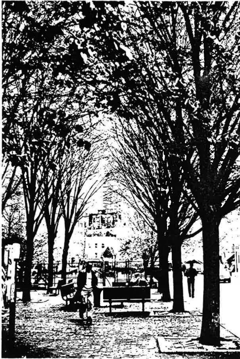
Bleecker Street Park, New York City

702 GREENWICH STREET • NEW YORK, NEW YORK 10014