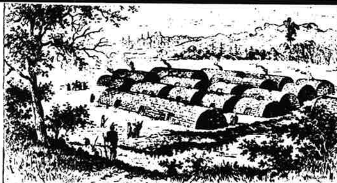
Manhattan Island before the Dutch

Contributions to The West Village Committee Inc. are tax-deductible.