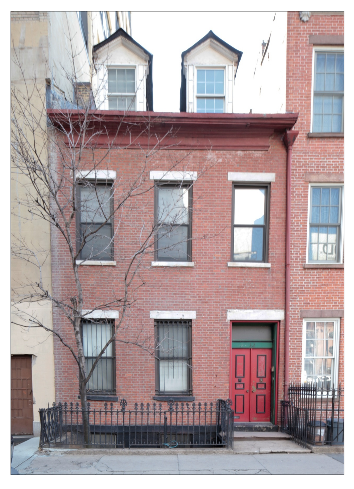
32 Dominick Street House 32 Dominick Street, Manhattan Block: 578, Lot: 64 Photo: Olivia T. Klose , 2011