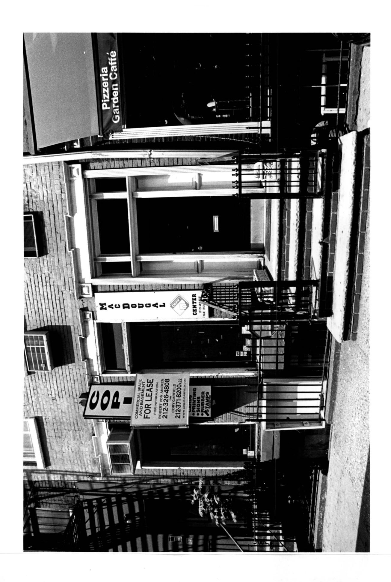
127 MacDougal Street House, first story