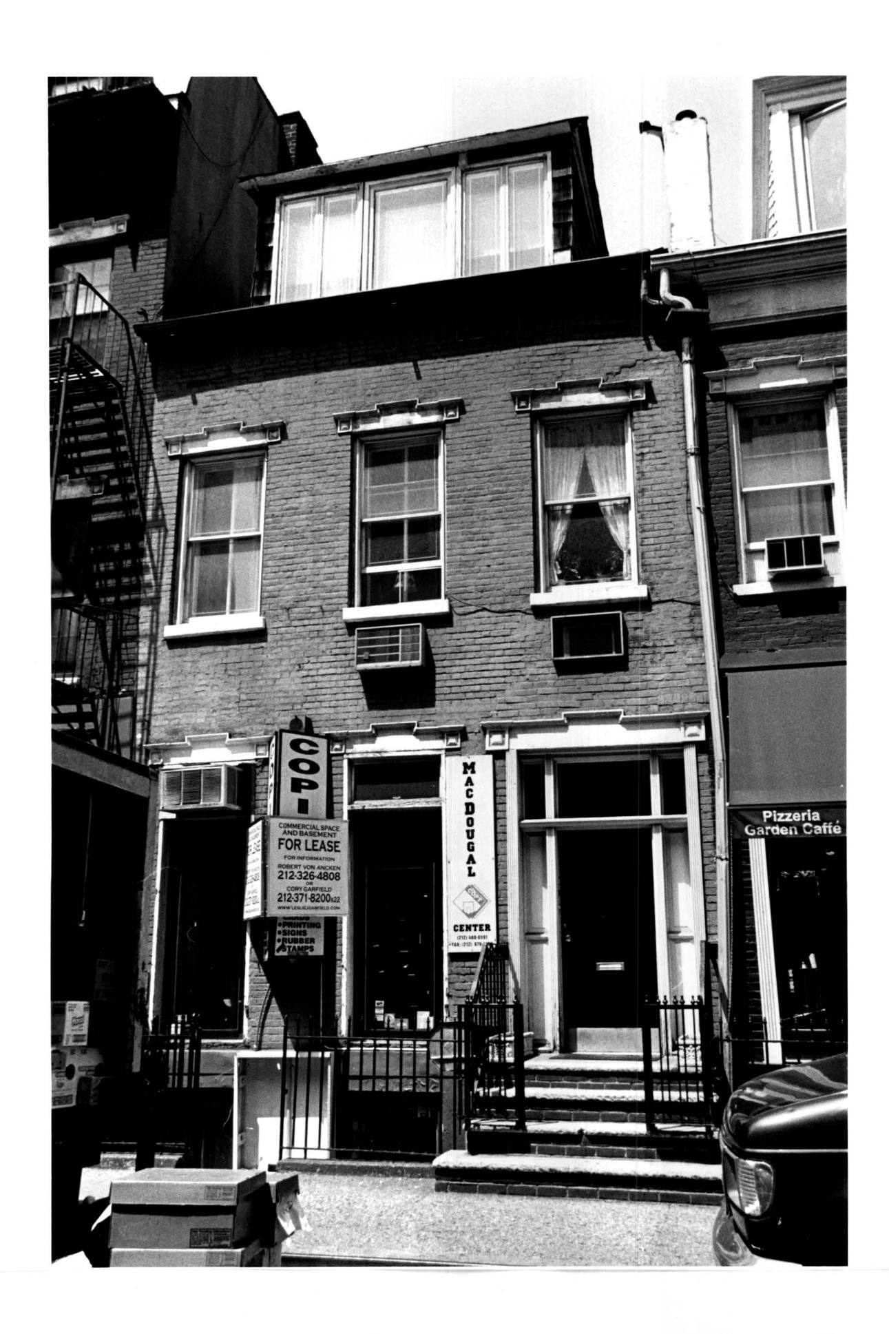
127 MacDougal Street House