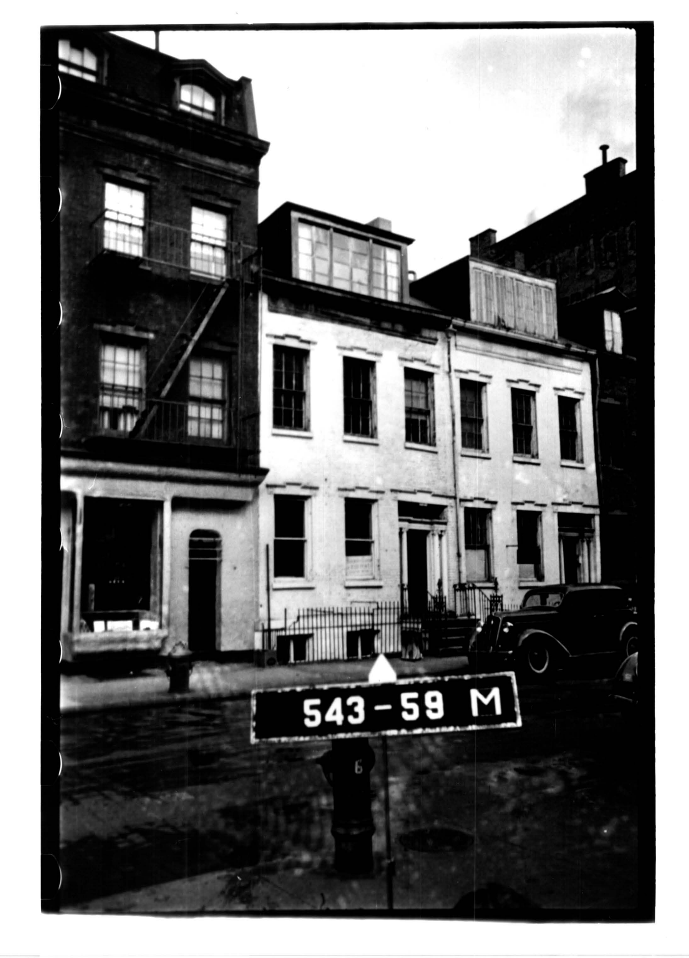
127 MacDougal Street House (c. 1939)