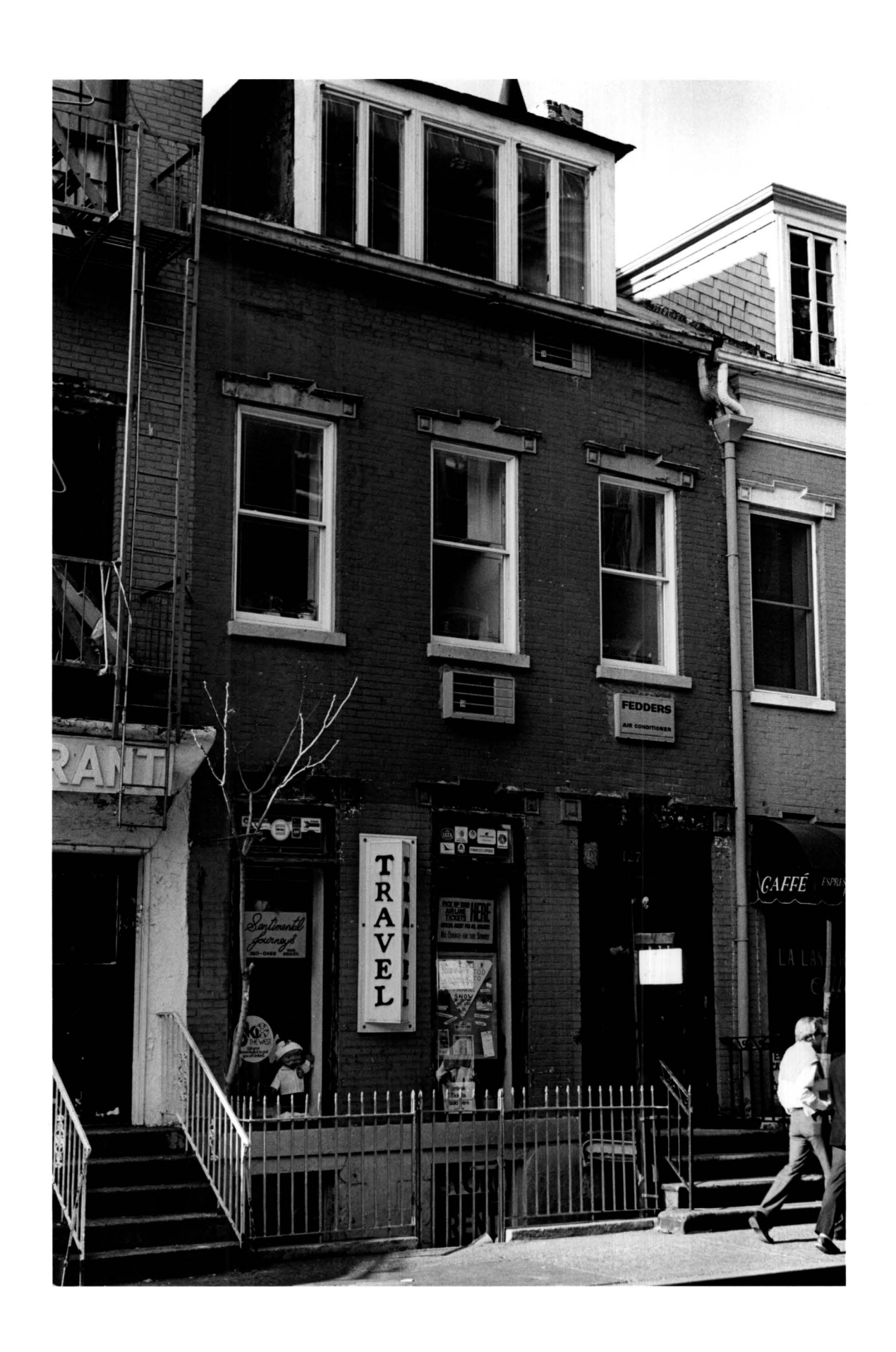
127 MacDougal Street House (1978)