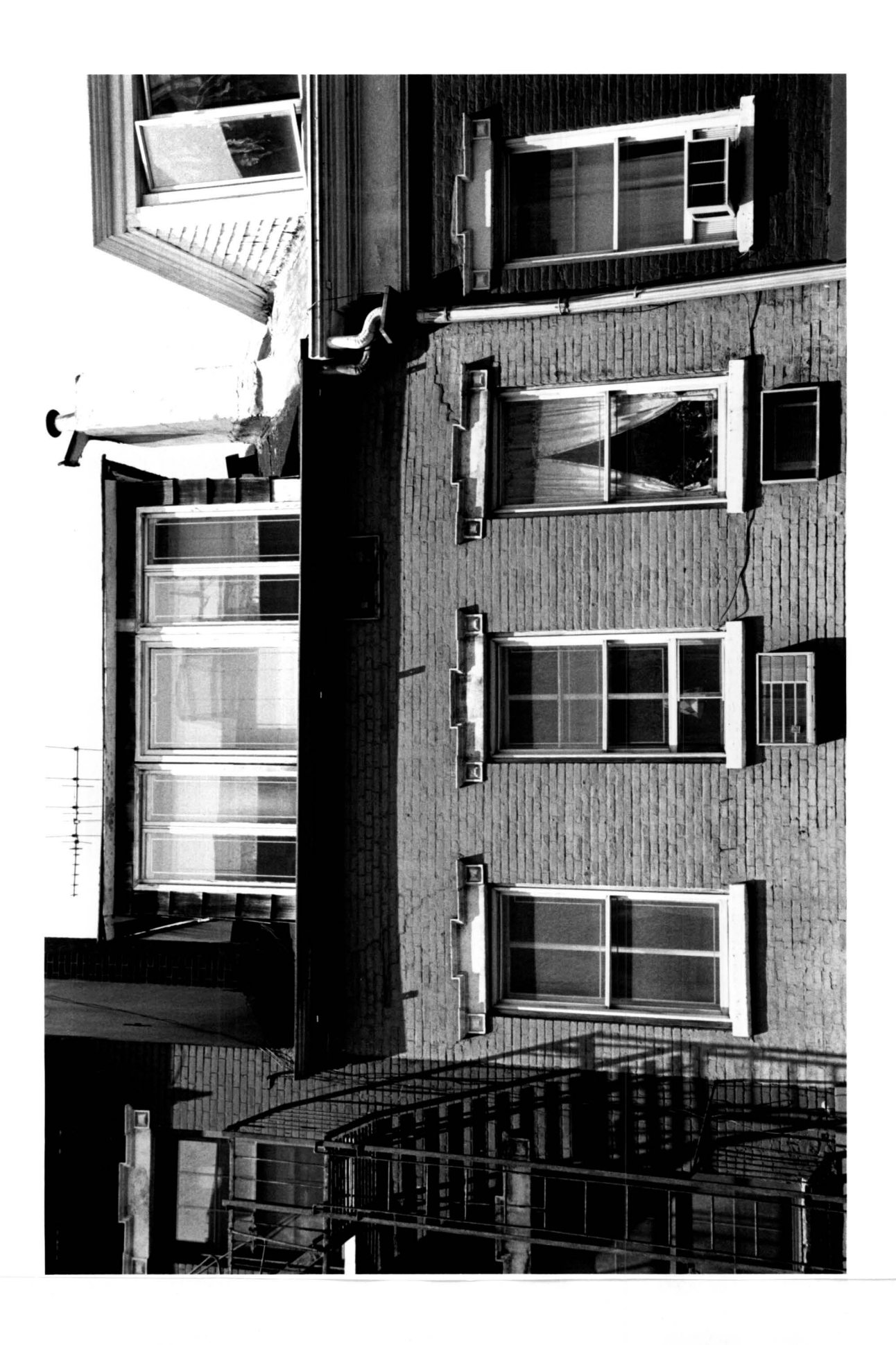
127 MacDougal Street House, upper section