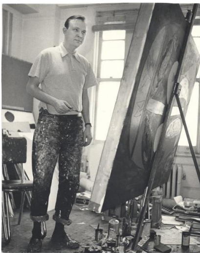
Robert Motherwell, 1952