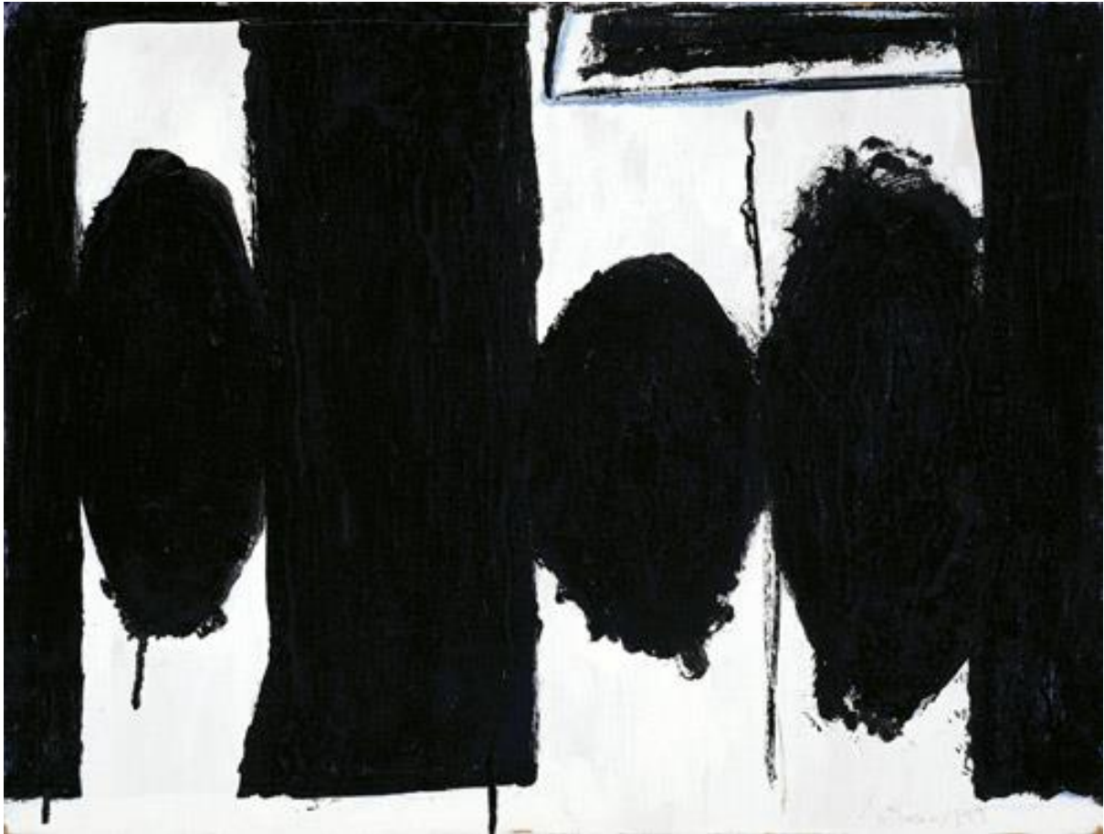
“At Five in the Afternoon,” 1948=49, the first painted picture in the Elegy to the Spanish Republic series

The Kootz Gallery, after a one-year hiatus, re-opened in 1949 at 600 Madison Avenue. Its first exhibition was The Intrasubjectives . The catalogue featured an essay by Harold Rosenberg, and brought together artists who would later be known as the Abstract Expressionists, including de Kooning, Gorky, Pollock, Rothko, Reinhardt, Tomlin Baziotes, Gottlieb, Hare, Hans Hofmann and Motherwell.