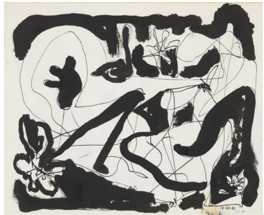
The Mexican Sketchbook, 1941, MOMA

Shortly thereafter, Motherwell spent time in Mexico, where he created his ink drawings in the Mexican Sketchbook (Collection of the Museum of Modern Art), later moving to apartments at 8 Perry and 33 West 8 th Street. By the autumn of 1942 he had been introduced to Willem de Kooning and Jackson Pollack by William Baziotos. Other artists and mid-century luminaries whom Motherwell would come to interact with in New York included Max Ernst, Anais Nin , Andre Breton, Hans Hofmann, Marcel Duchamp, and Peggy Guggenheim.