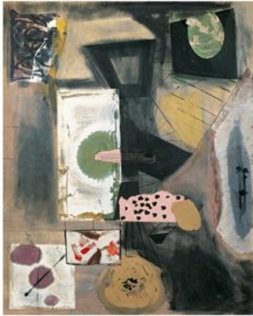
Joy of Living, 1943, Dedalus Foundation