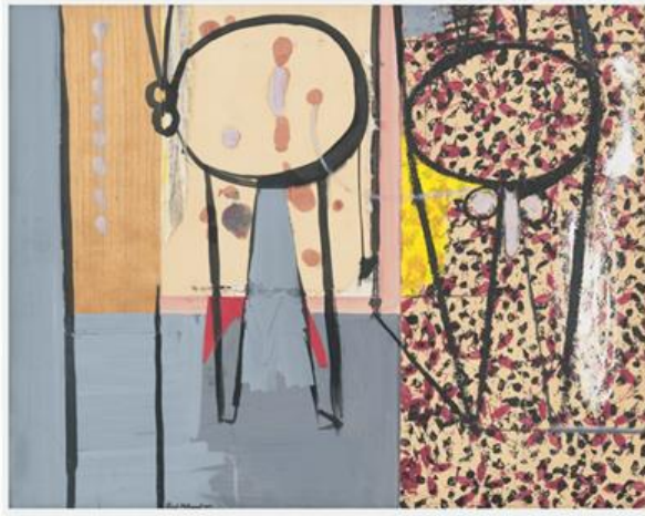
Pancho Villa, Dead and Alive, 1943, MOMA

During this time, Motherwell began to lecture on art, and his writings on the subject were published in journals such as Dyn and Partisan Review . Additionally, he developed a series of writings contemplating contemporary art in collaboration with art critic Harold Rosenberg. He had his first solo exhibition at MOMA in 1944. In 1945, he signed a five-year contract with the Samuel M. Kootz Gallery and his work was featured in exhibitions in museums around the country. Alongside Baziotes, David Hare, Rothko and Clyfford Still, he started a school run by and for artists known as 'The Subjects of the Artist,' which helped cement the downtown art scene. In August of 1949, Motherwell traveled to Provincetown with Willem de Kooning, and delivered the talk "Reflections on Painting Now" as part of a symposium distinguishing between the emerging "New York School" and the "Paris School" of artists.