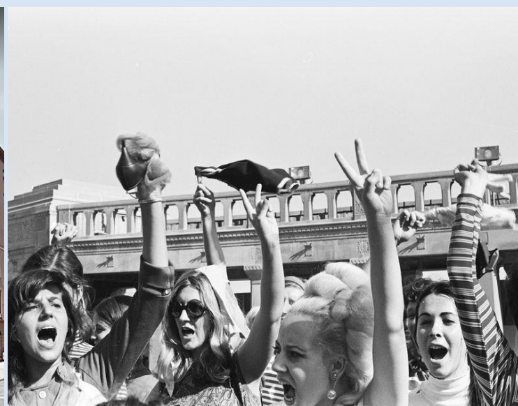
(top) 34 East 10 th Street, Valerie Bettis; 6 East 12 th Street, Jessie Franklin Turner gown (middle) 40-50 East 10 th Street, Dawn Powell; 12 East 12 th Street, Ronnie Spector, Patti Smith (bottom) Chaka Khan; former St. Denis Hotel (demolished 2019), New York Radical Women demonstration at Miss America Pageant in Atlantic City, 1968