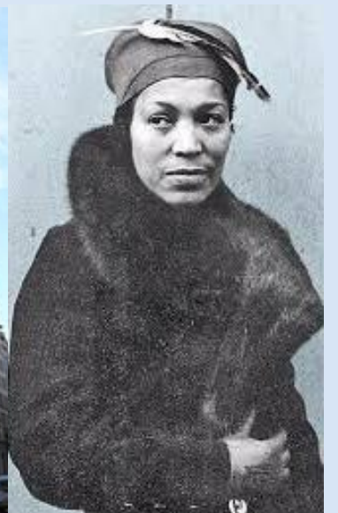
(top) 86 University Place, Audre Lorde; 88 East 10 th Street, Selma Hortense Burke (middle) 814 Broadway, Nan Goldin slideshow; 51 Fifth Avenue, Jane Freilicher (bottom) Albert Hotel, Joni Mitchell; 70 Fifth Avenue, Zora Neale Hurston