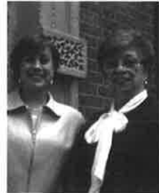
The Caring Community