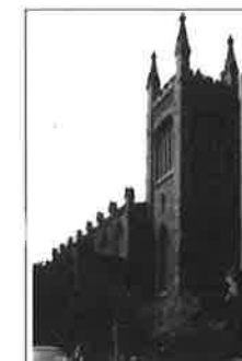
Church of the Ascension