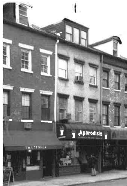
These Federal Rowhouses on Bleeker Street are among the buildings which will be studied.

The Preservation League of New York State/New York State Council on the Arts Grant Program is a partnership of the Preservation League of New York State, a state-wide not-for-profit member-