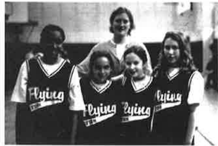
The Greenwich Village Girls Basketball League