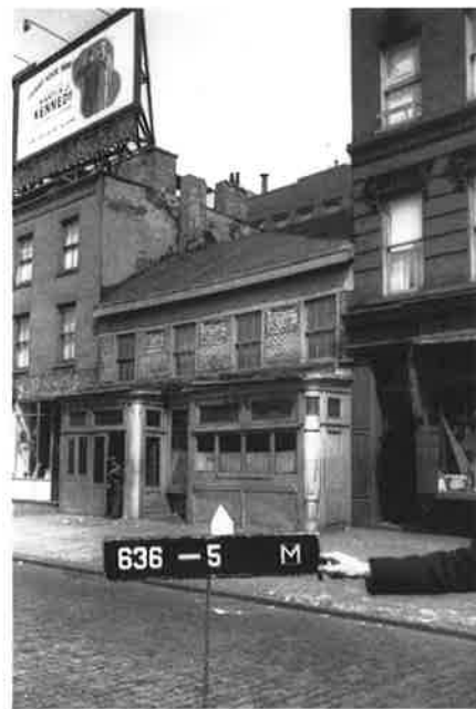
#392 West Street, Department of Taxes, ca. 1939.