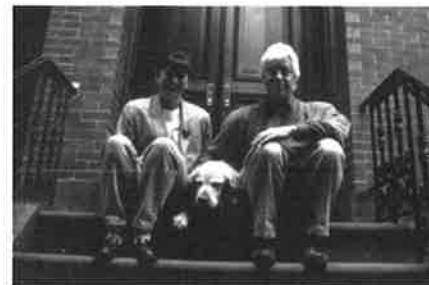
Front Stoop Award: 71 Jane Street