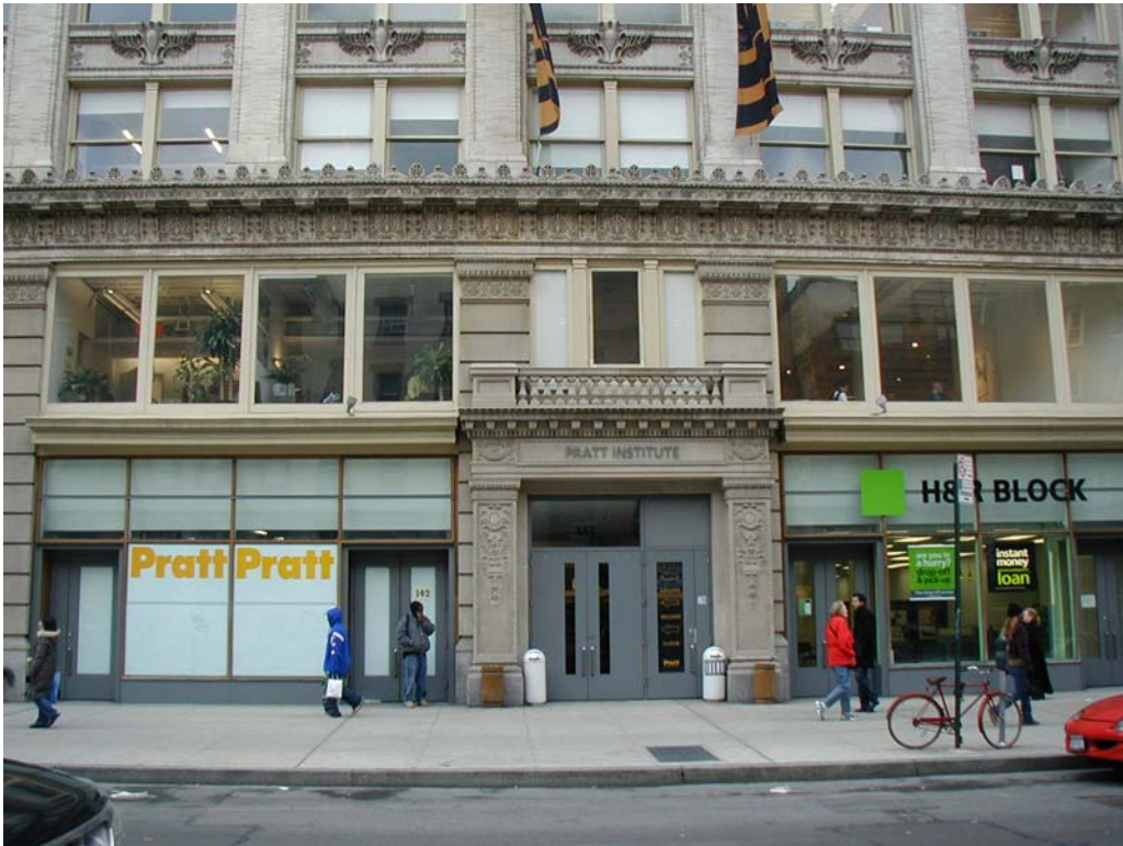
144 West 14 th Street