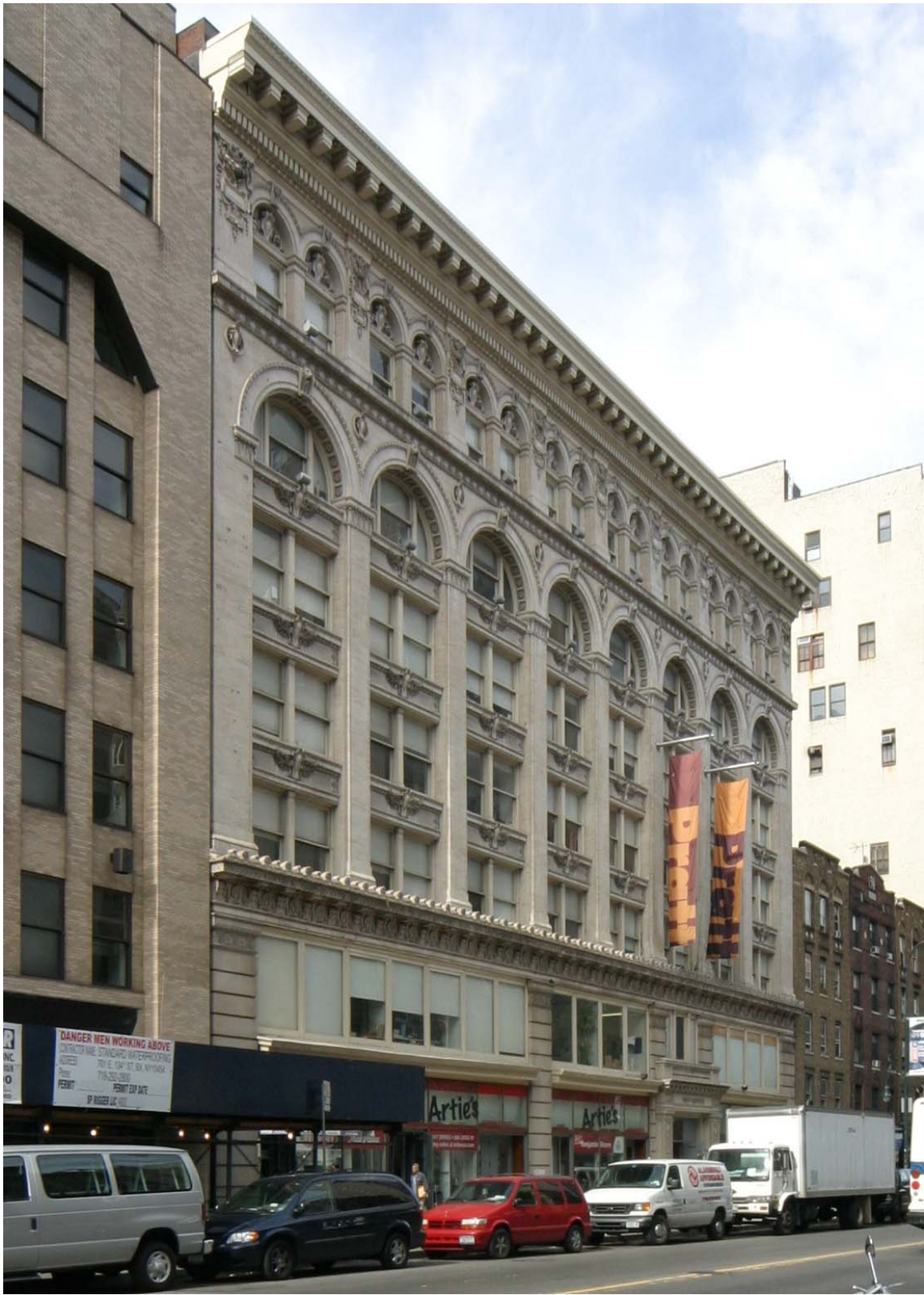
144 West 14 th Street (aka 136-146 West 14 th Street)