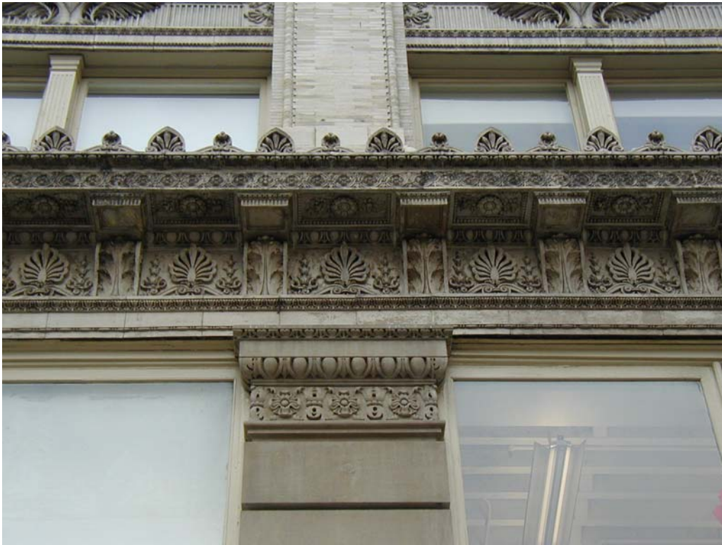
144 West 14 th Street Details